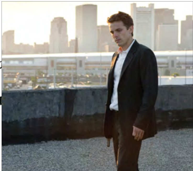
GO AFFLECK GO: Casey Affleck appears in Gone, Baby, Gone , a thriller based on the novel by Dennis Lehane. The movie will be released in theaters Oct. 19.

If there is a recurring theme this fall, it is one of star-laden casts, as Casey Affleck, Morgan Freeman, Ed Harris and Michelle Monaghan team up with first time director Ben Affleck for this suspense-filled crime thriller based on the acclaimed novel by Dennis Lehane.