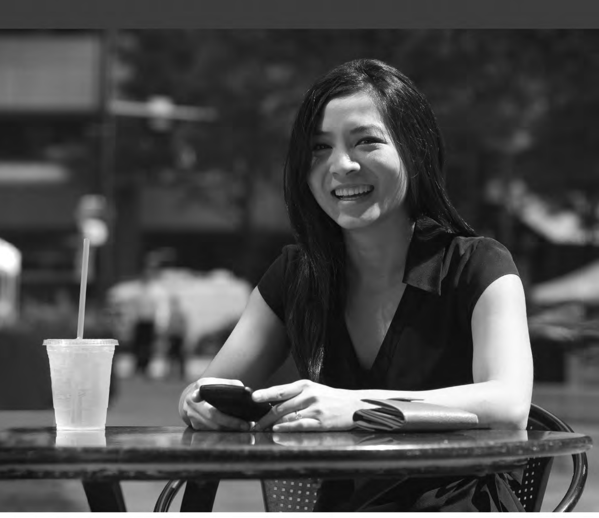
COMMERCIAL REAL ESTATE BANKING

Gain responsibility early and often. Work with prestigious clients. Learn from leading financial services professionals. Seize your opportunity at one of the fastest growing global corporate and investment banks in the industry.