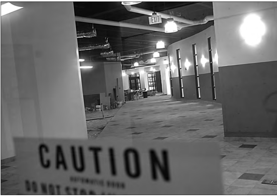
YALIMAR PANEL / THE BEACON

"This does not mean that the area will be useable as there may not be furniture or other [accessories] required