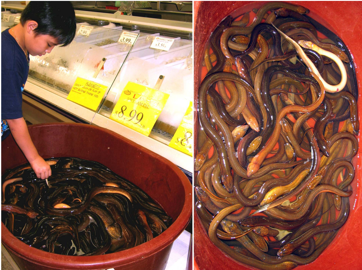
Figure 1. Left: Young customer inspecting tub of live Asian swamp eels for sale in an ethnic food market in a large U.S. city, 7 August 2003. These animals— Monopterus albus “Clade C”—were the source of the market specimens used in the study (Field# LGN03-35b). Information derived from cargo container labels and customs records indicated these swamp eels were part of larger air shipments originating in Vietnam and that the fish were from the wild. Right: Tub of live Asian swamp eels for sale in same market, 1 June 2004 (Field# LGN04-07).

muscle tissues and certain morphological characteristics (e.g., body color pattern), we determined that all swamp eels examined in our study, both the market specimens and those captured in Florida waters, belonged to the group designated as “Clade C” within the Monopterus albus species complex (Collins et al. 2002; T.M.Collins and L.G.Nico, unpublished data).