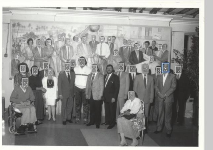
Fig. 2: AWS's Missing Detection, showing faces of people (and background) not being detected

(Figure 2), and a false detection (Figure 3). Besides those two errors, the faces in the other pictures were appropriately recognized. The individual time spent per picture varied from 2 seconds to 7 seconds, and the overall time spent by AWS to provide results on the dataset was between 220 to 350 seconds.