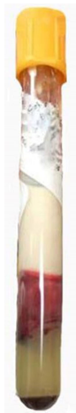
Figure 1 Lipemic serum after centrifugation.

lipase tests were normal. In addition, liver and spleen size were also normal.