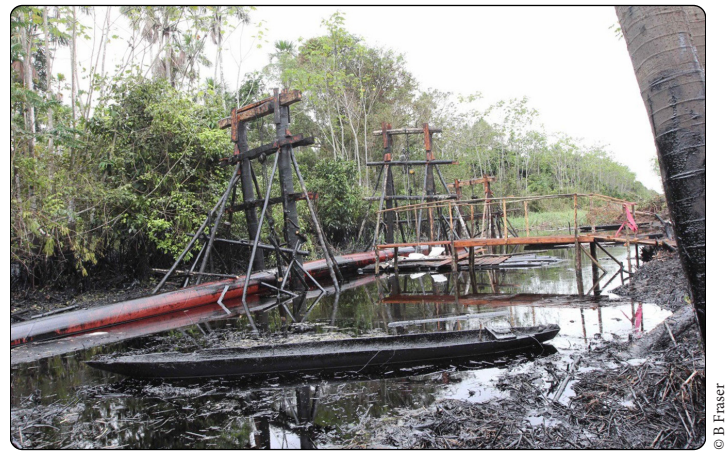
Figure 4. Oil spills occur frequently in parts of the Amazon, often multiple times a year from a single pipeline. The impacts of these events can affect Amazonian ecosystems and the people that depend on them for many years afterward. Used with permission.

There is a widespread need for governments and civil society to better understand the hundreds of Indigenous cultures that inhabit the Amazon, and to strengthen and support alliances with and between Indigenous peoples (with the exception of uncontacted tribes; Fraser 2017). The deep, reciprocal relationships that Amazonian Indigenous cultures have with surrounding ecosystems offer some of the strongest opportunities and assets for achieving conservation goals in the face of energy development, and provide a reason to conserve these ecosystems in the first place. Yet such relationships remain largely unappreciated by outsiders to those cultures. For example, rivers are linked to the cultures and worldviews of many Amazonian Indigenous groups. The Shawi, who live near Peru's Cordillera Escalante, recognize rivers as energizing forces that facilitate connection with and sustain ancestors (Figure 1; Huertas Castillo and Chanchari 2012). The Kukama, who live near the confluence of the Marañon and Ucayali rivers in the western Amazon, believe that underwater cities provide shelter to drowned relatives and view certain freshwater environments, such as oxbow lakes, as sacred. These cultural connections are being leveraged by the Kukama, NGOs, and scientists to call for reconsideration of Chinese–Peruvian plans for the development of an Amazonian Waterway (Hidrovia Amazónica) that would dredge hundreds of kilometers of the Marañon