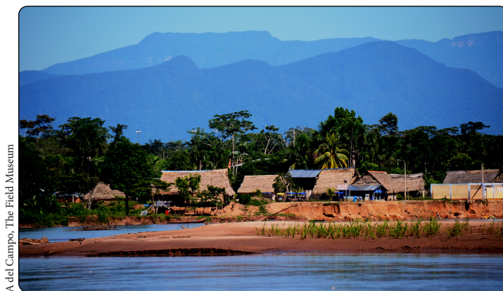
Figure 1. The Amazon River Basin is the world’s largest fluvial system and home to more than 30 million people, many of whose lives and livelihoods are influenced by these rivers. However, most legal and institutional frameworks for conservation in the Basin focus on terrestrial areas.

Despite being the world’s largest freshwater system, there is a lack of specific frameworks for conservation of aquatic environments and their biodiversity in the Amazon River