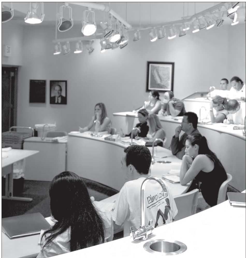
WINE TIME: Wine Technology, one of the most popular courses offered at the School of Hospitality and Management, has a wine testing room specifically built for the class. The room includes special red and white lights to view the wine and miniature sinks used to cleanse wine glasses after use.

"We teach that at the very beginning of class," he said. Despite the warnings he believes, "It's the best beverage you can put in your mouth."