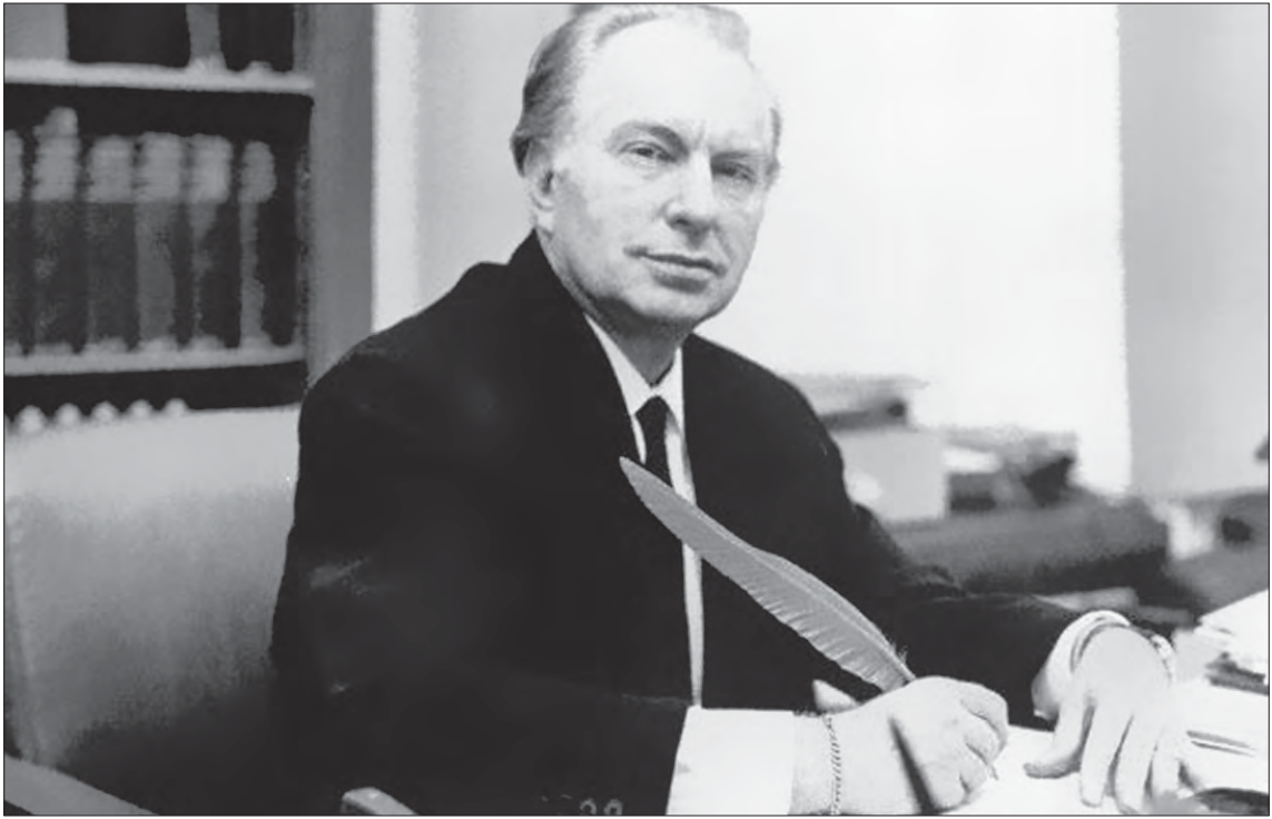
SPACE COWBOY: L. Ron Hubbard was the founder of Scientology, a religion that holds some strange beliefs, such as the belief that space planes were used many years ago. Many dismiss Scientology as little more than a cult.

I always personally believed Jesus was insane. According to the Gospel of John (10:30) Jesus says "I and the Father are