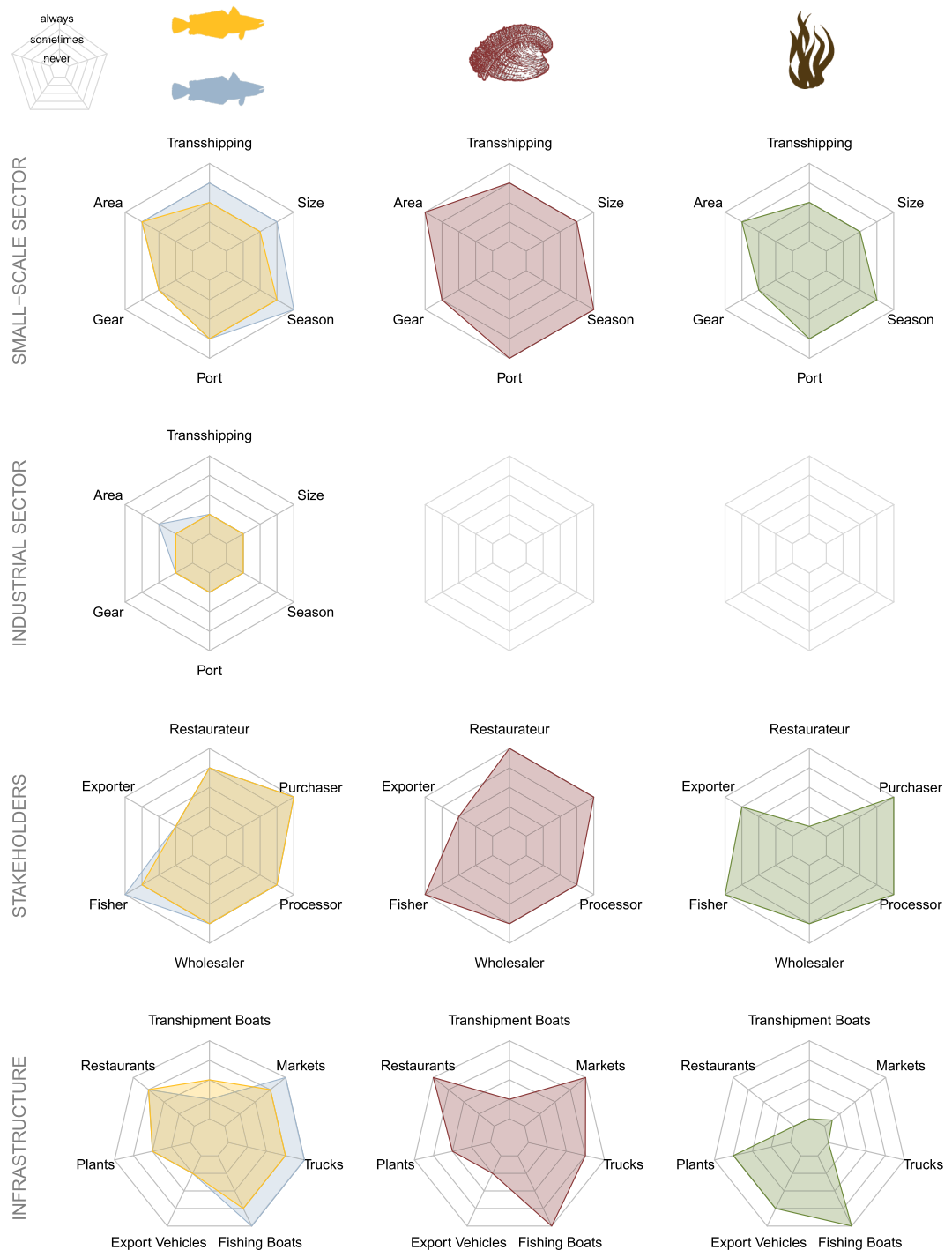
Figure 2. Fishery profiles of four Chilean fisheries: south Pacific hake (blue), southern hake (orange), Chilean abalone (red), and kelp (green). Predicted median estimates of the level of illegality in industrial sector activity, small-scale sector activity, stakeholders, and infrastructure. Industrial fishing does not exist for Chilean abalone and kelp. Predicted medians are from a Bayesian cumulative multinomial logit model for each of the four focal fisheries. The entire posterior distributions of the model results are shown in Figs. S2–S5.

Our results also produced new information on illegal activity in Chile, including relative high estimates for red-cusk eel ( Genypterus chilensis ), southern rays bream ( Brama australis ), and anchoveta ( Engraulis ringens ), of which the latter fishery accounted for ~ 40% of annual landings in 2018 33 . The fishery profiles provide additional layers of information on stakeholders, infrastructure, and activities within sectors. For Chilean abalone, for example, illegal activity appears to be dominated by small-scale fishers (fishing boats), restaurateurs (restaurants), and buyers (markets). In contrast, illegal activity in the kelp fishery is dominated by stakeholders and infrastructure connected to processing and exporting. While IUU activities are often dynamic 49 , fisheries profiles