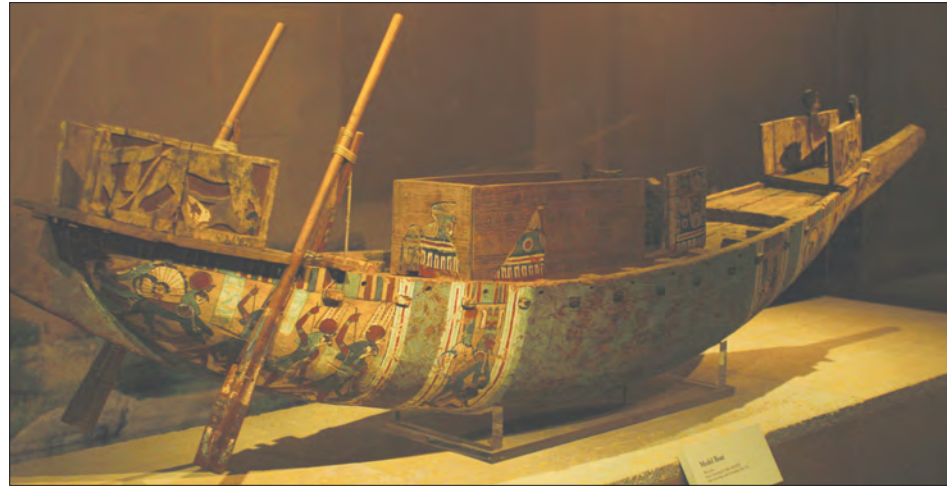
EGYPTIAN DISCOVERIES: Many models, such as the Amenhotep II model boat above, were showcased at the King Tutankhamun exhibit.

It strikes you when you try to understand how the Egyptians were able to make such pieces without the technology we have today. Scientists are still trying to uncover how the pyramids were built using only the strength of men and no