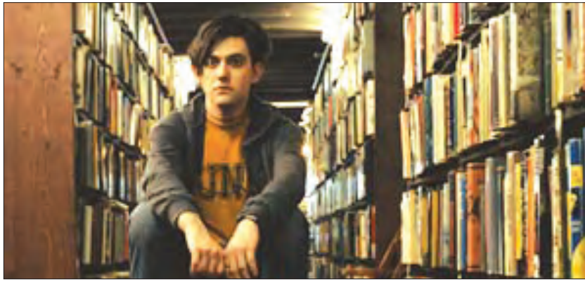
TORTURED ARTIST: Conor Oberst of the indie rock group Bright Eyes spreads himself too thin by releasing two albums at the same time.

"Music genius." "Child prodigy." "Rock and roll troubadour." "Bob Dylan!?" The scrawny Nebraskan I absolutely love to hate has so many names nowadays, but I only know him by one: CONOR. A colleague of mine and I have shared the ongoing joke for the past year to make fun of this poor boy and his band as often as possible - ad nauseam.