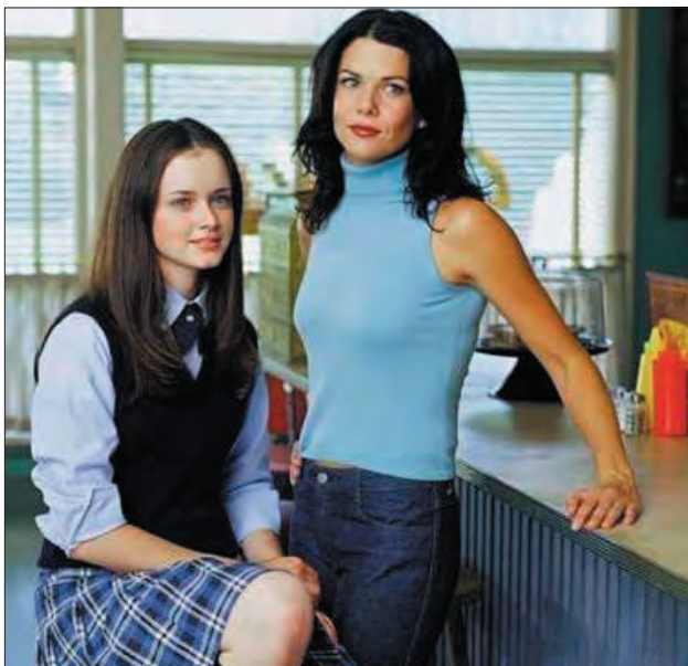
SCHOOL GIRLS: The hit WB show "Gilmore Girls" celebrated its 100th episode with the favorite mother-daughter duo.

The series has given us some indelible characters. Scott Patterson's Luke Danes has done for coffee shops what John Corbett did for radio stations on "Northern Exposure." Kelly Bishop and Edward Herrmann's Emily and Richard are such real, vibrant characters.