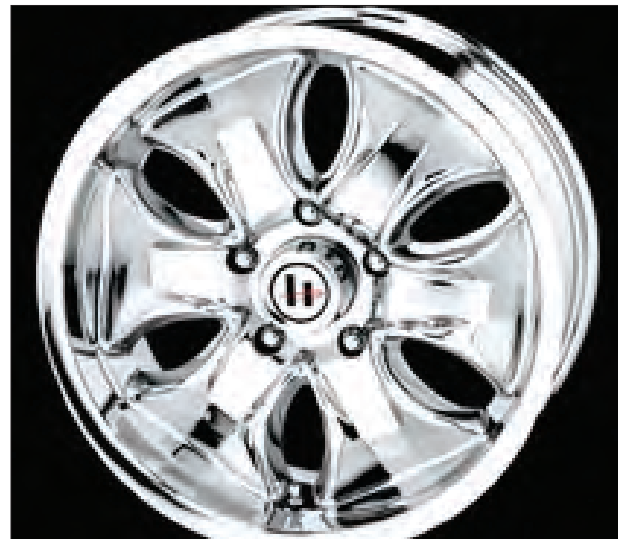
SPINNING IN CIRCLES: Many students find popular spinning hubcaps like these annoying and tacky.