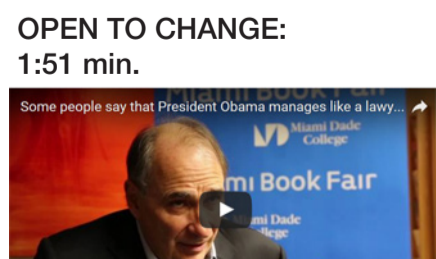
Some people say that President Obama manages like a lawyer...