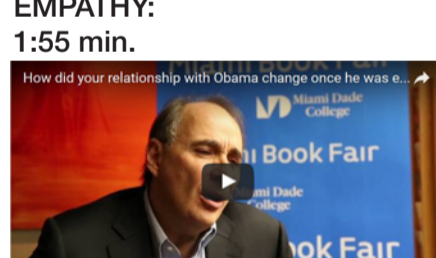
How did your relationship with Obama change once he was e...