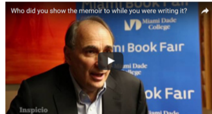
Who did you show the memoir to while you were writing it?