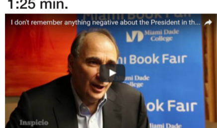
I don't remember anything negative about the President in th...