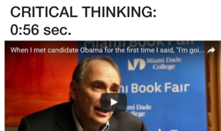
When I met candidate Obama for the first time I said, "I'm goi...