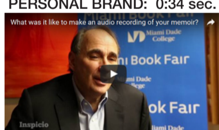
What was it like to make an audio recording of your memoir?