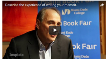
Describe the experience of writing your memoir.