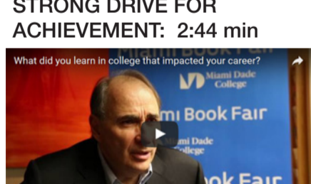
What did you learn in college that impacted your career?