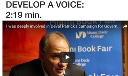
I was deeply involved in Deval Patrick's campaign for Govern...