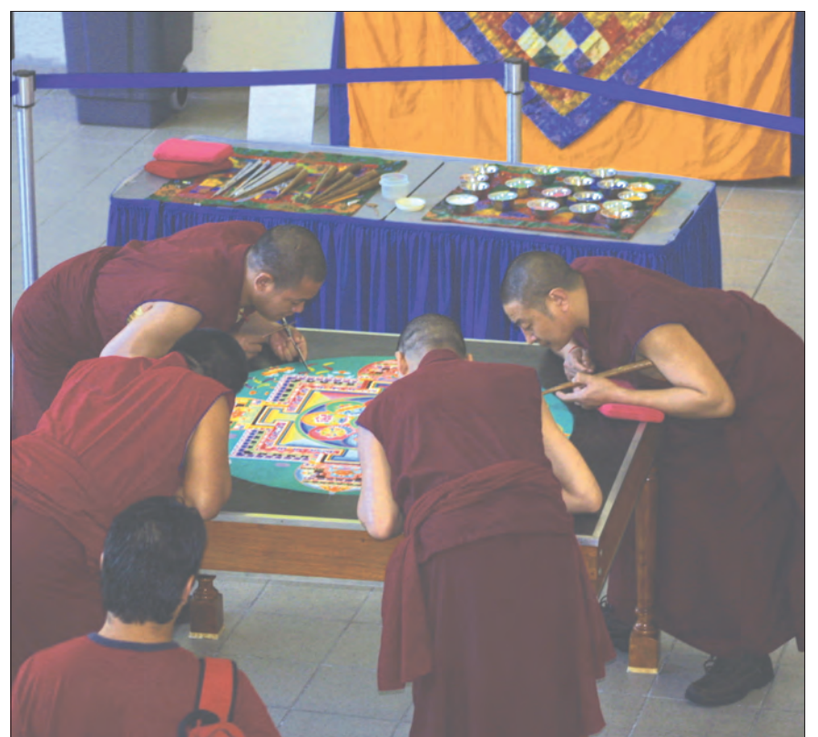
HEAVENLY GRAINS: Tibetan buddhist monks worked diligently on the mandala for three days before removing it to consecrate the ritual.

They used funnels called chakpur to pour the sand