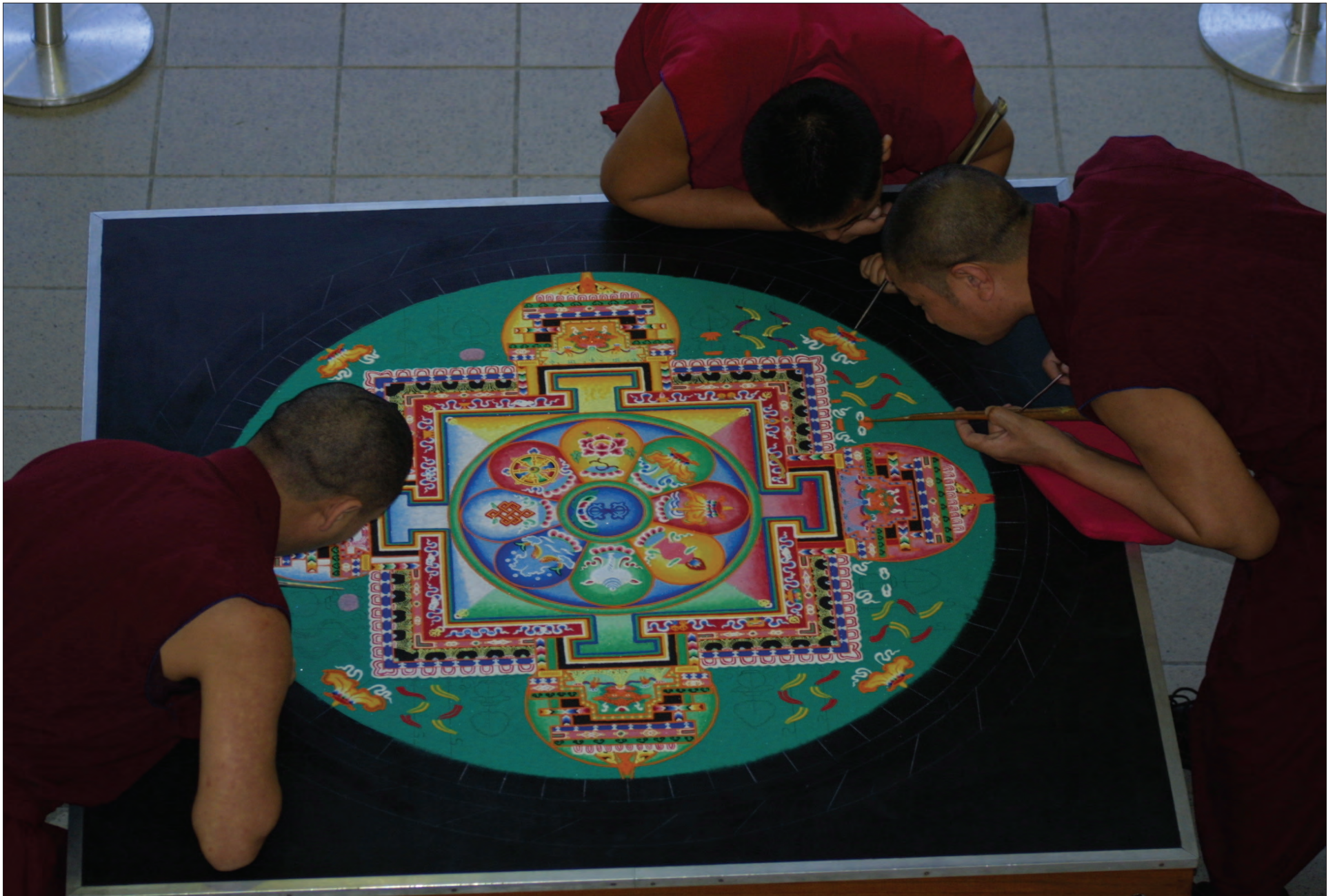
SAND ART: The mandala represents different things to people. It represents art for artists, music to musicians and dance to the dancers.