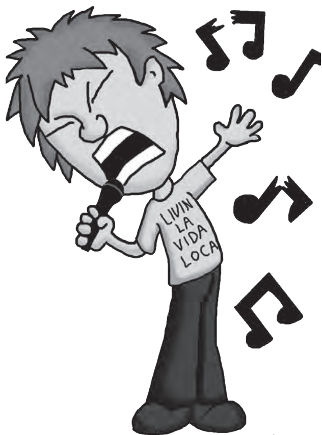
ART BY LUIS NIN/THE BEACON

The show is scheduled to air in February 2005 on Sunday nights.