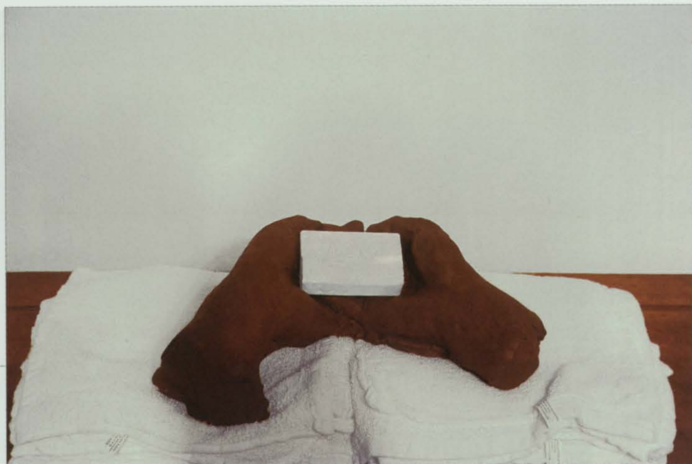
Wash My Sins Away 2002 Mixed Media 27 x 20 x 12 in.

Born: October 4, 1949, Wilkes-Barre, Pennsylvania