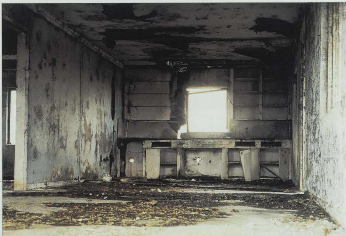
Structures in Stages: Rte. 98 2002 C-print 16 x 20 in.