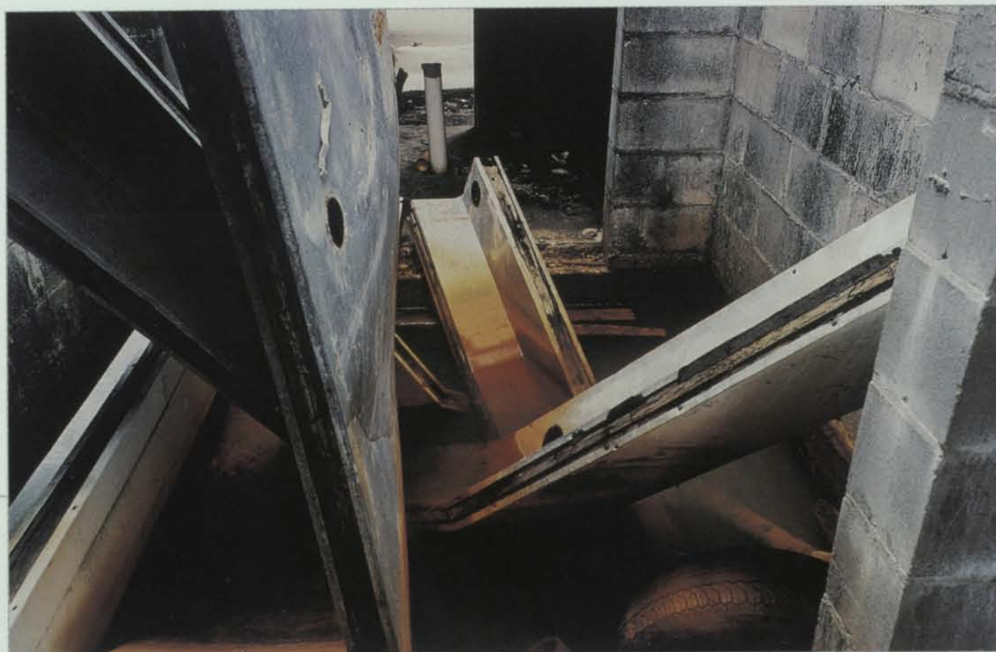
Interior Remains: Rte. 17 2002 C-print 20 x 24 in.