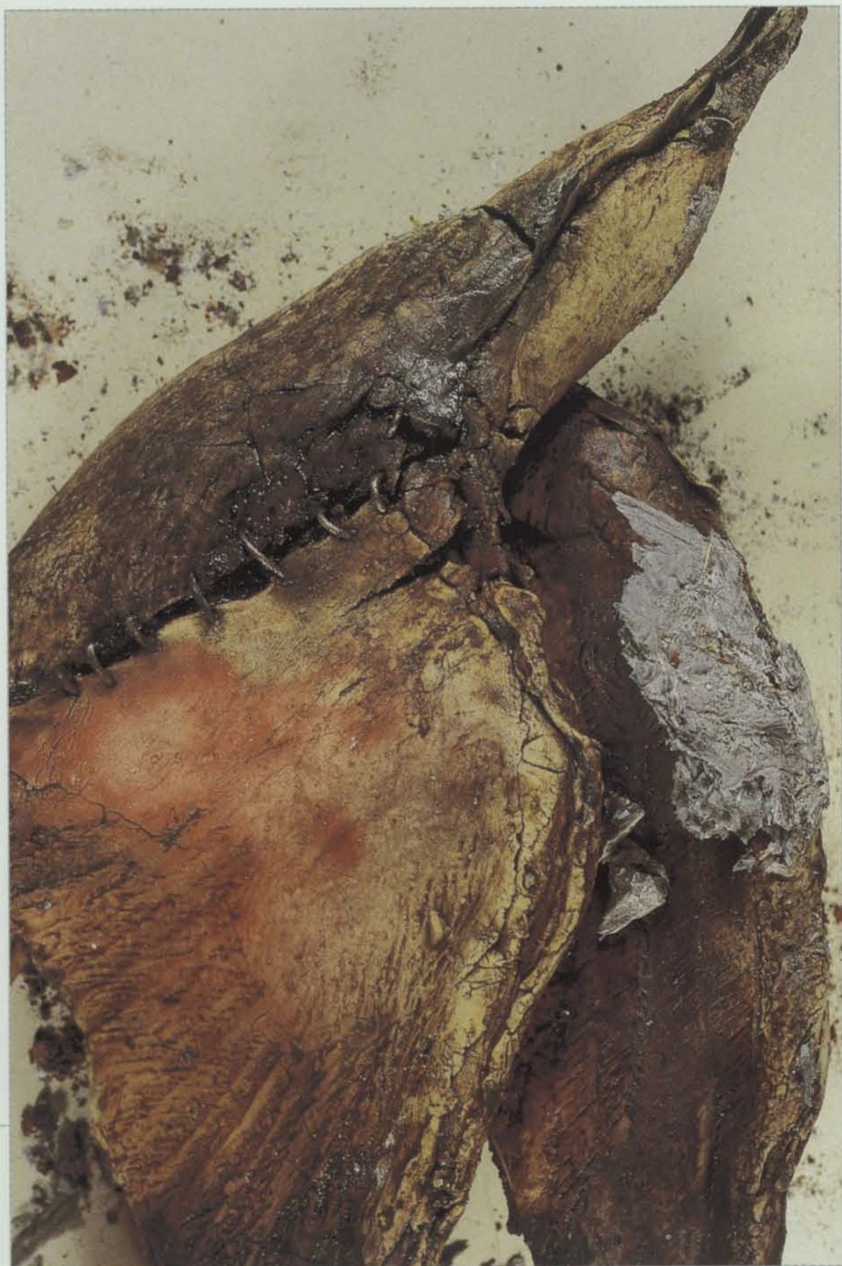
Clay Pigeon (detail) 2002 Porcelain Variable

Born: December 24, 1957, Greenwich, Connecticut