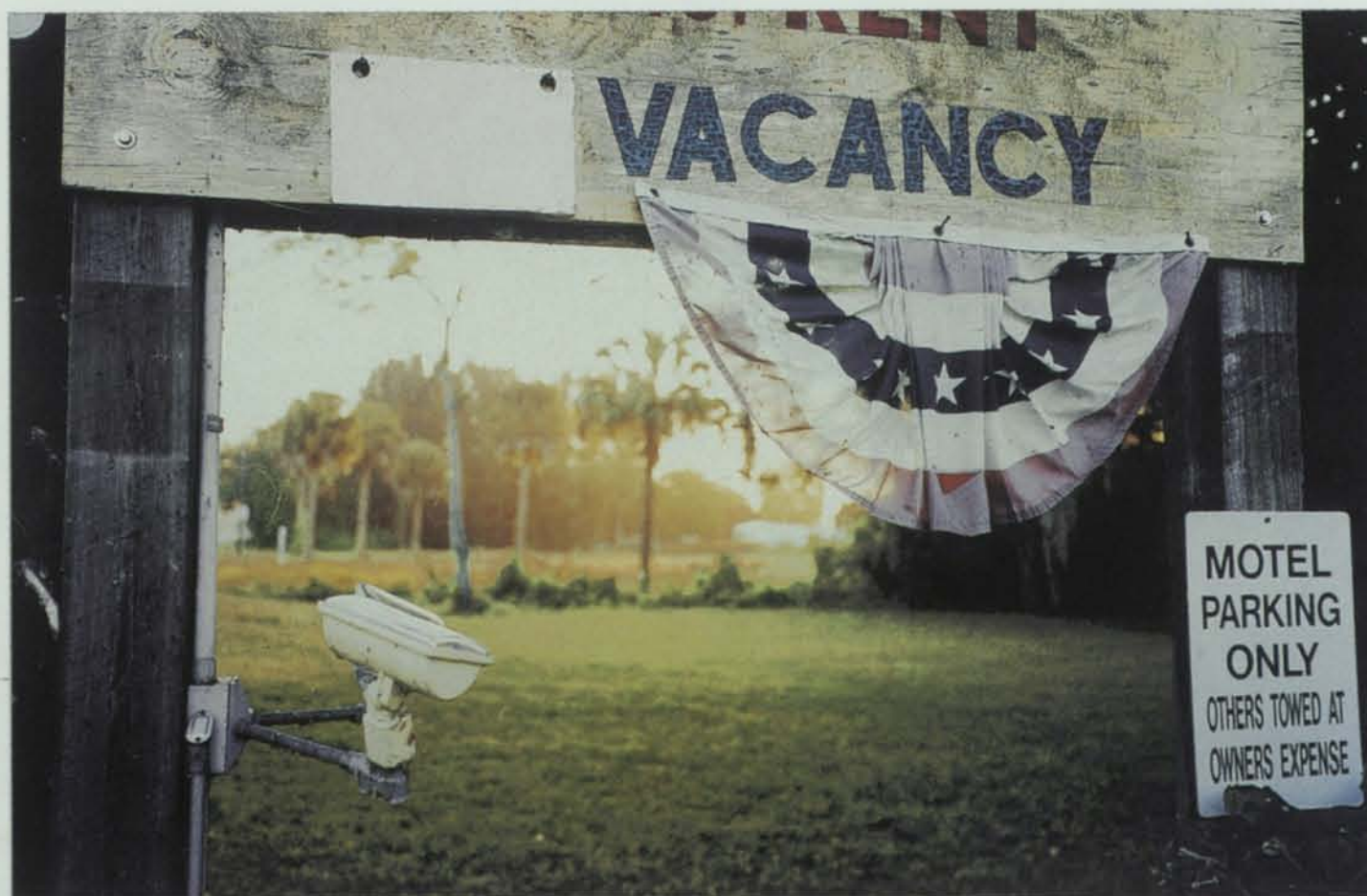
Structures in Stages: Rte. 60 2002 C-print 16 x 20 in.