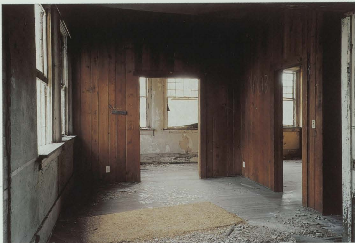
Interior Remains: Rte. 64 2002 C-print 16 x 20 in.