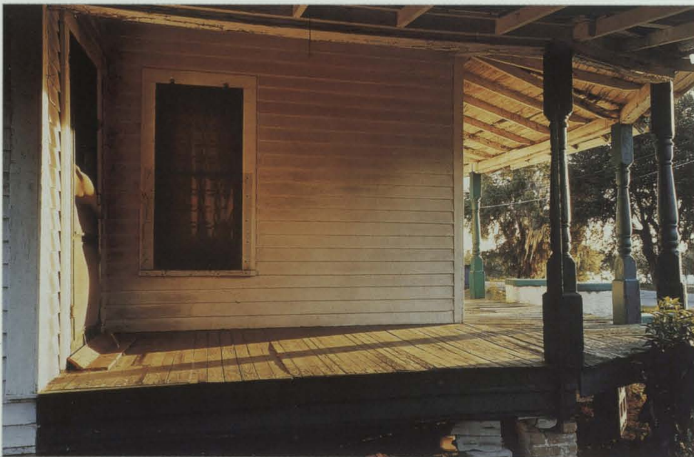
Roadside Attractions: Off of Rte. 17, WinterHaven C-print 20 x 24 in.