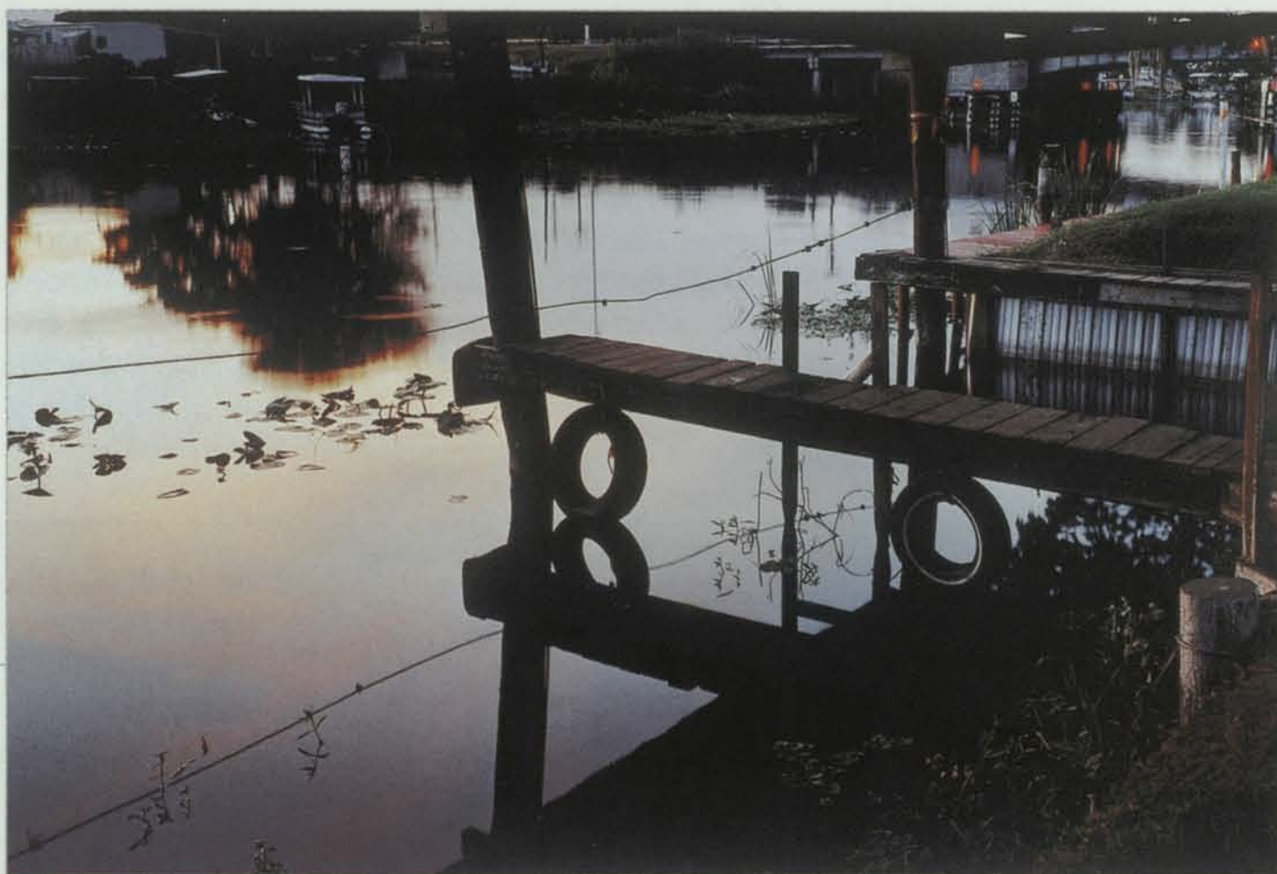
Roadside Attractions: Rte. 98, Taylor Creek 2002 C-print 16 x 20 in.

Born: December 17, 1947, Whitestone, New York