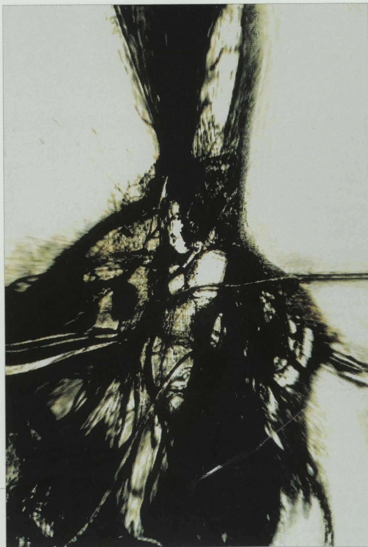
Root Figure 2002 Scanned weeds on paper 7 x 5 in.

julie lópez Born: November 30, 1973, Miami, Florida