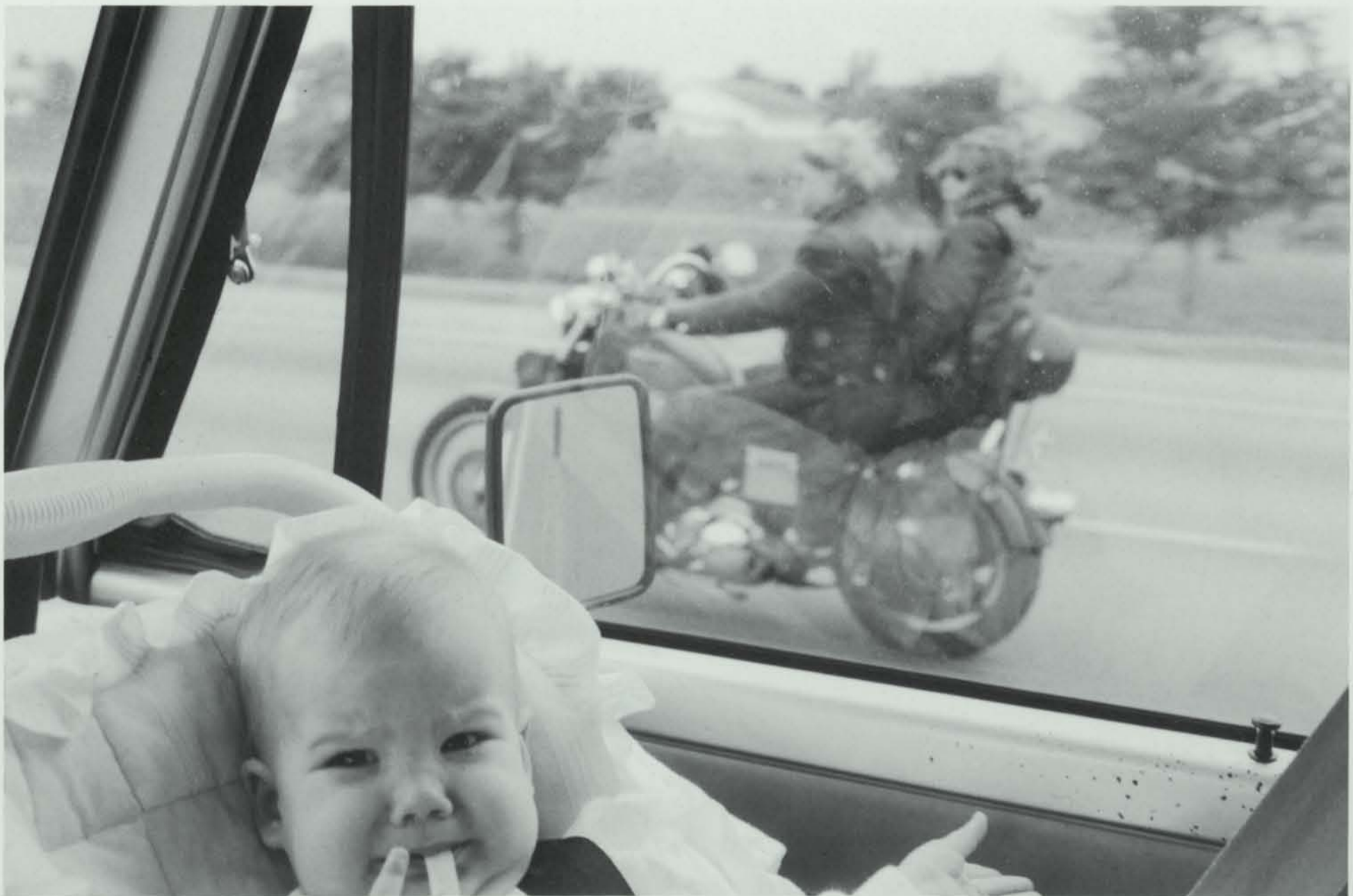
Untitled , 1994, Black and white photograph, 11" x 14"

1997 BFA Florida International University, Miami, FL