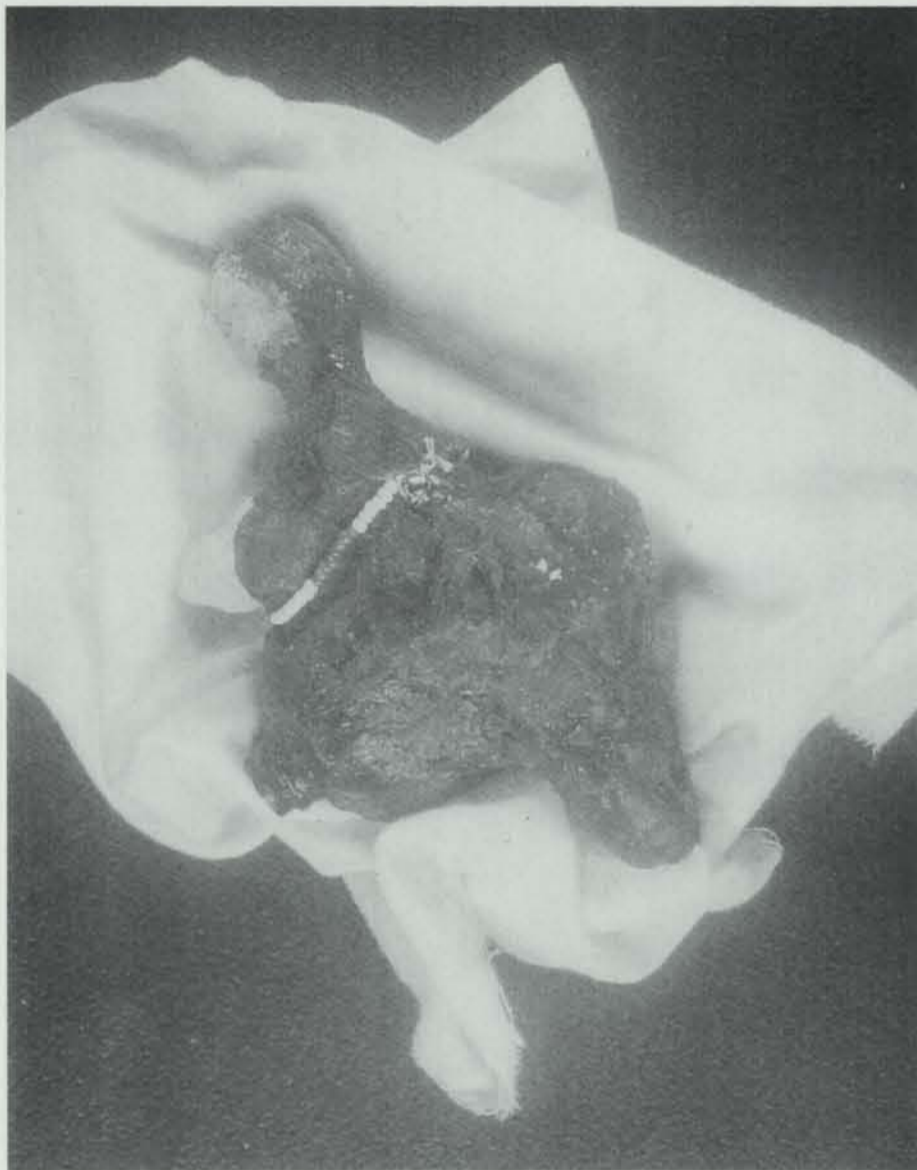
Courage Figure , 1997, Mixed media, 4" x 2"