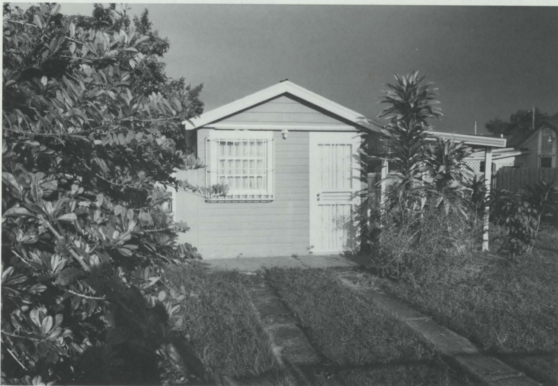
Untitled #1 , 1996, C-print, 16" x 20"