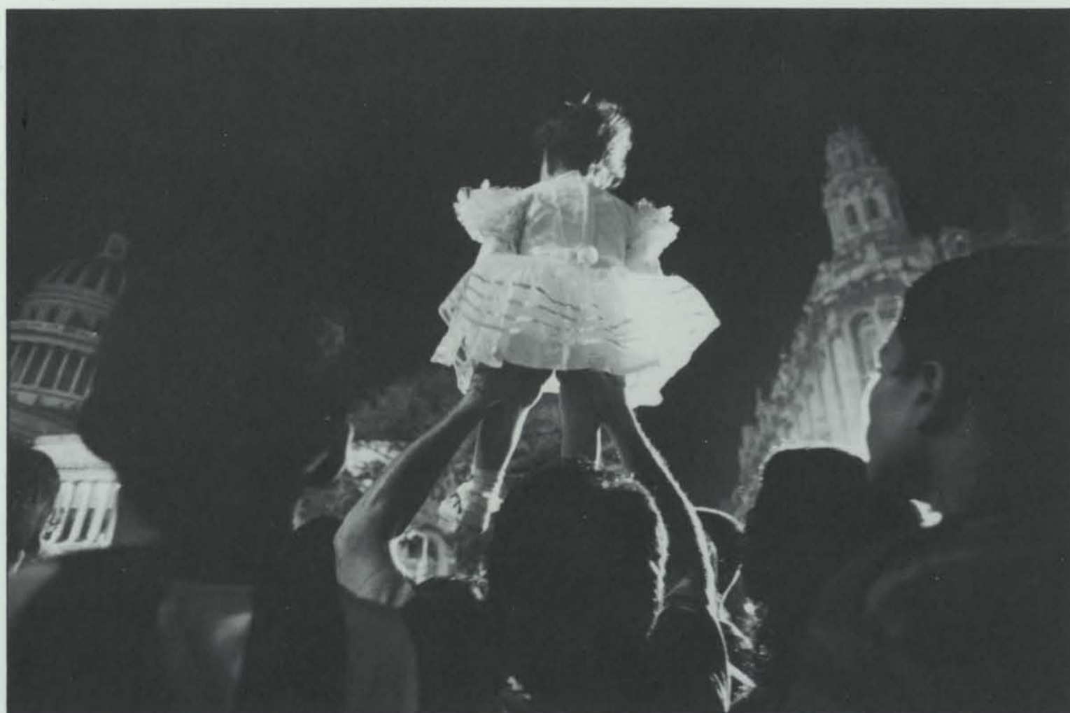
Hay sol bueno y mar de espuma , 1997, Photographic installation, 6' x 8'

Hay sol bueno y mar de espuma , 1997 Photographic installation 6' x 8'