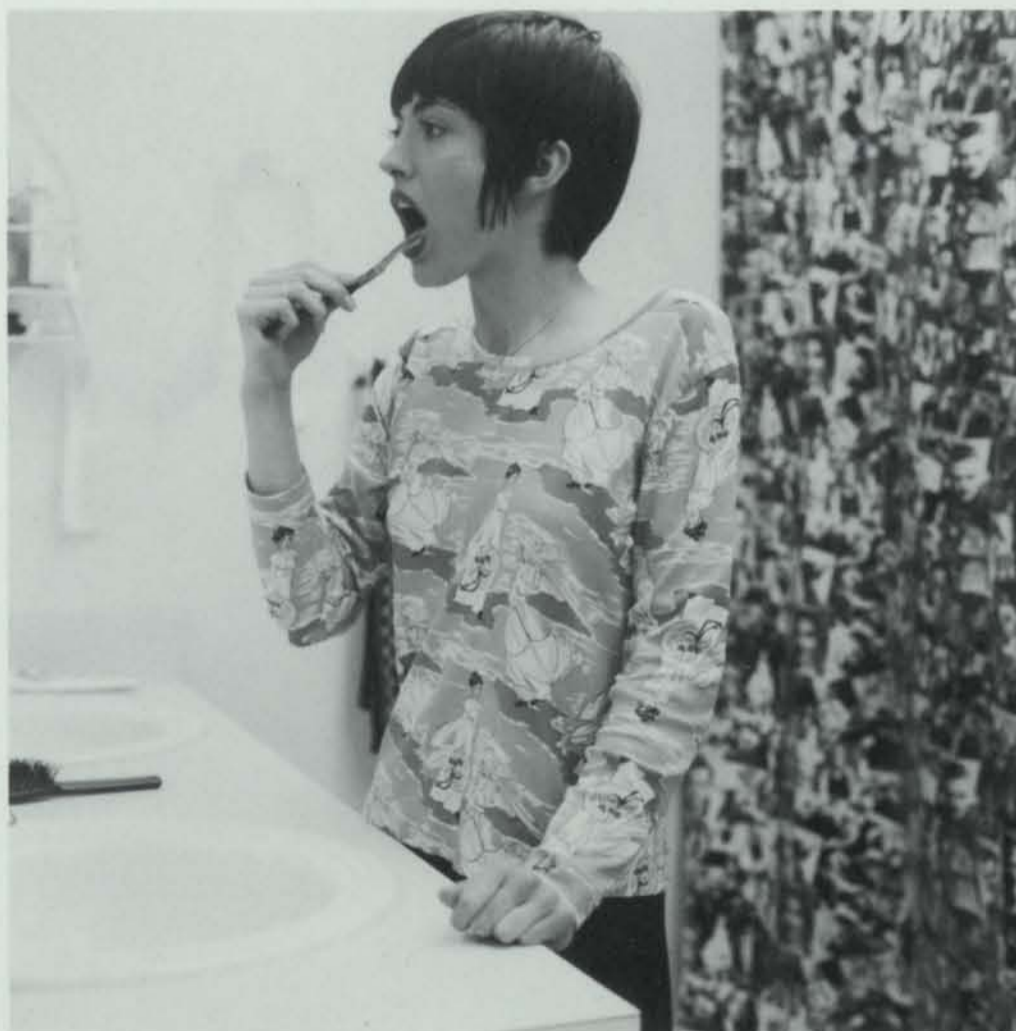
Untitled , 1996, C-print, 16" x 20"