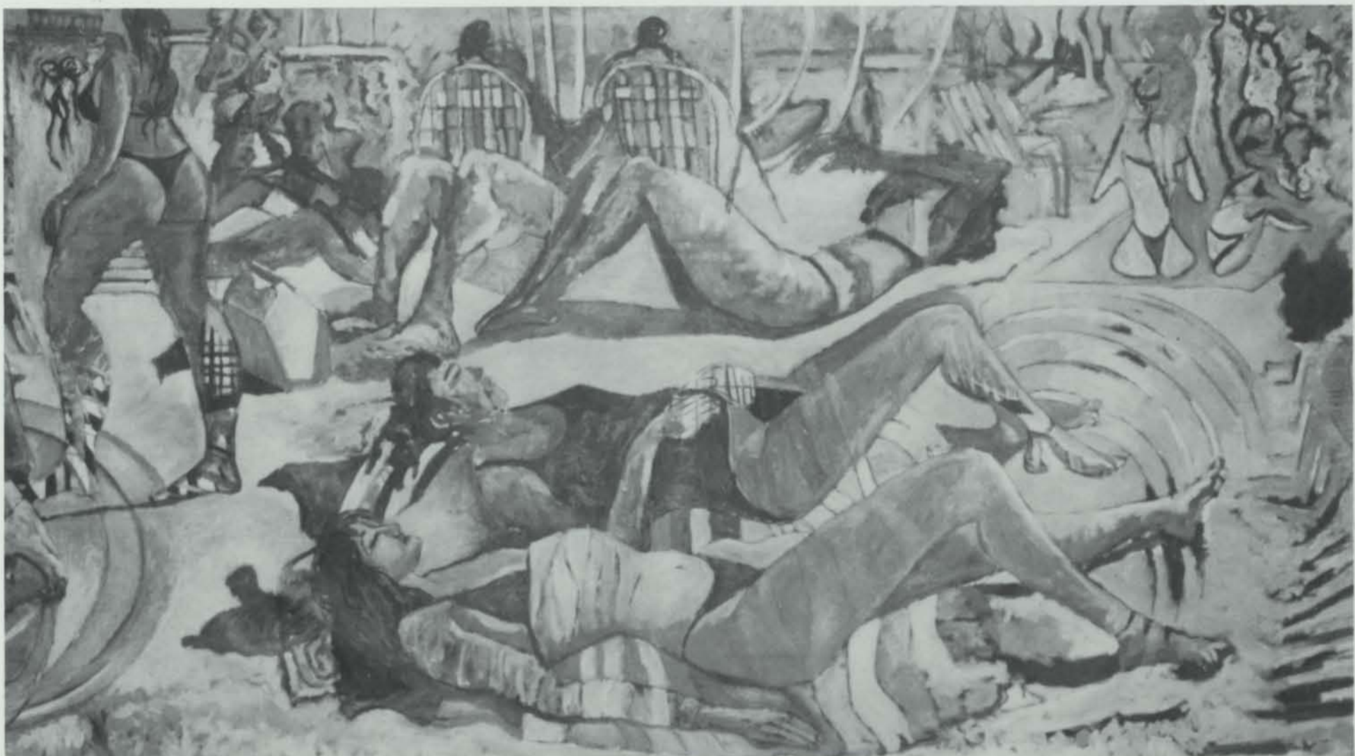
Cuban Dreams , 1997, Oil on canvas, 5' x 9'

Homage to My Friends at T.G.I. Fridays , 1996 Oil on canvas 5' x 9'