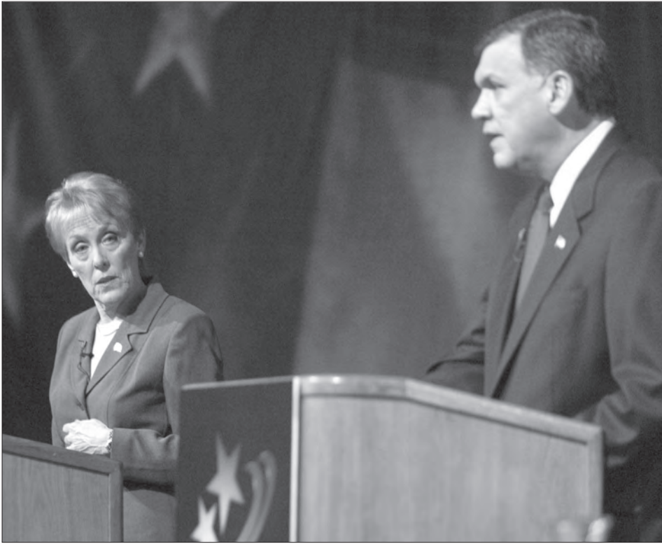
GRUDGE MATCH: Democrat Betty Castor (left) eyes Republican Mel Martinez (right) at their "Battle for the U.S. Senate" debate.

"All issues are important, but I think the minimum wage, the working