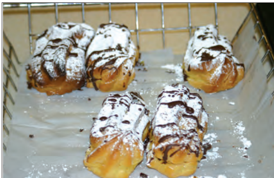
BON APETITE: A server at the Fresh Food Company prepares a hot plate of pasta for a student (above). The cafeteria offers several different types of food from Latin flavors (left) to sugary pastries (right).