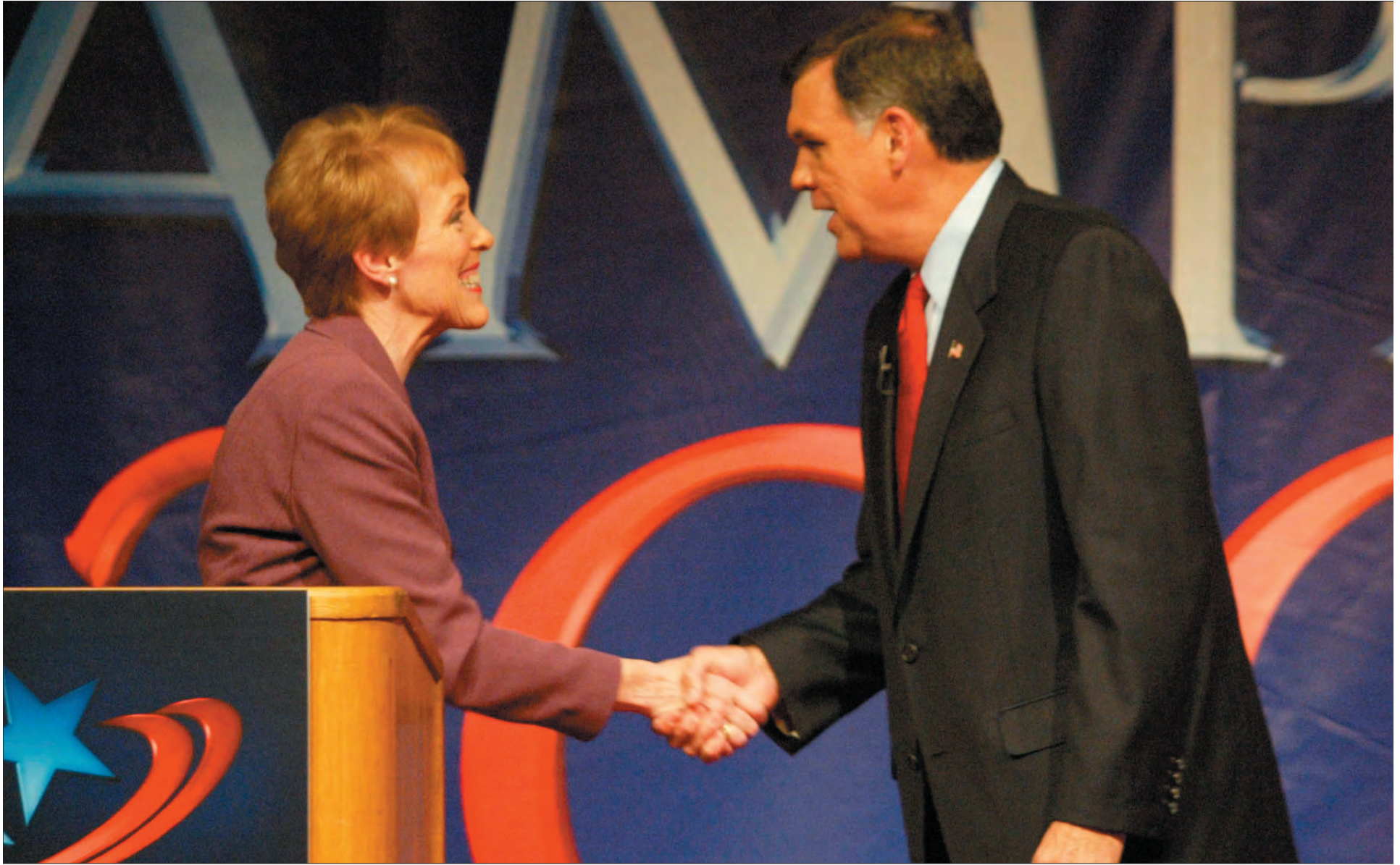
FRIENDLY FIRE: Democratic senatorial candidate Betty Castor (left) shakes hands with her Republican opponent, Mel Martinez (right) before a live debate held at FIU's University Park campus in the Green Library.