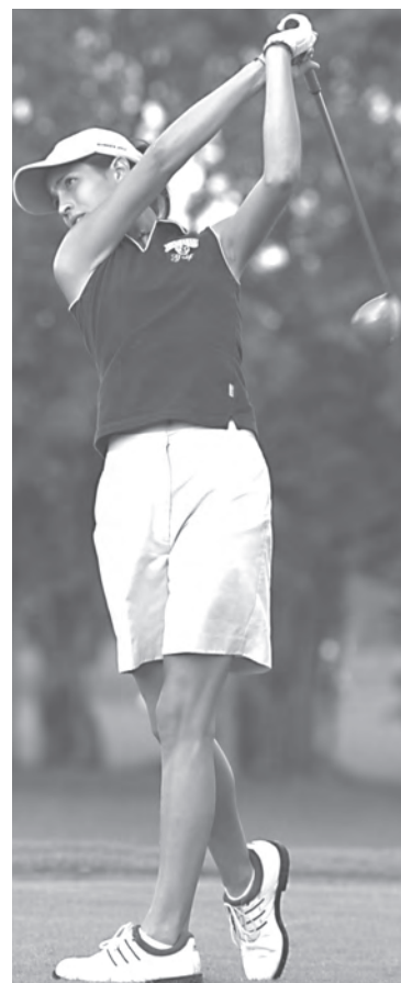
TOP 20: The golf team finished in 17th place and ahead of top teams at the Lady Paladin Invitational.

The tournament concluded the fall season for the team.