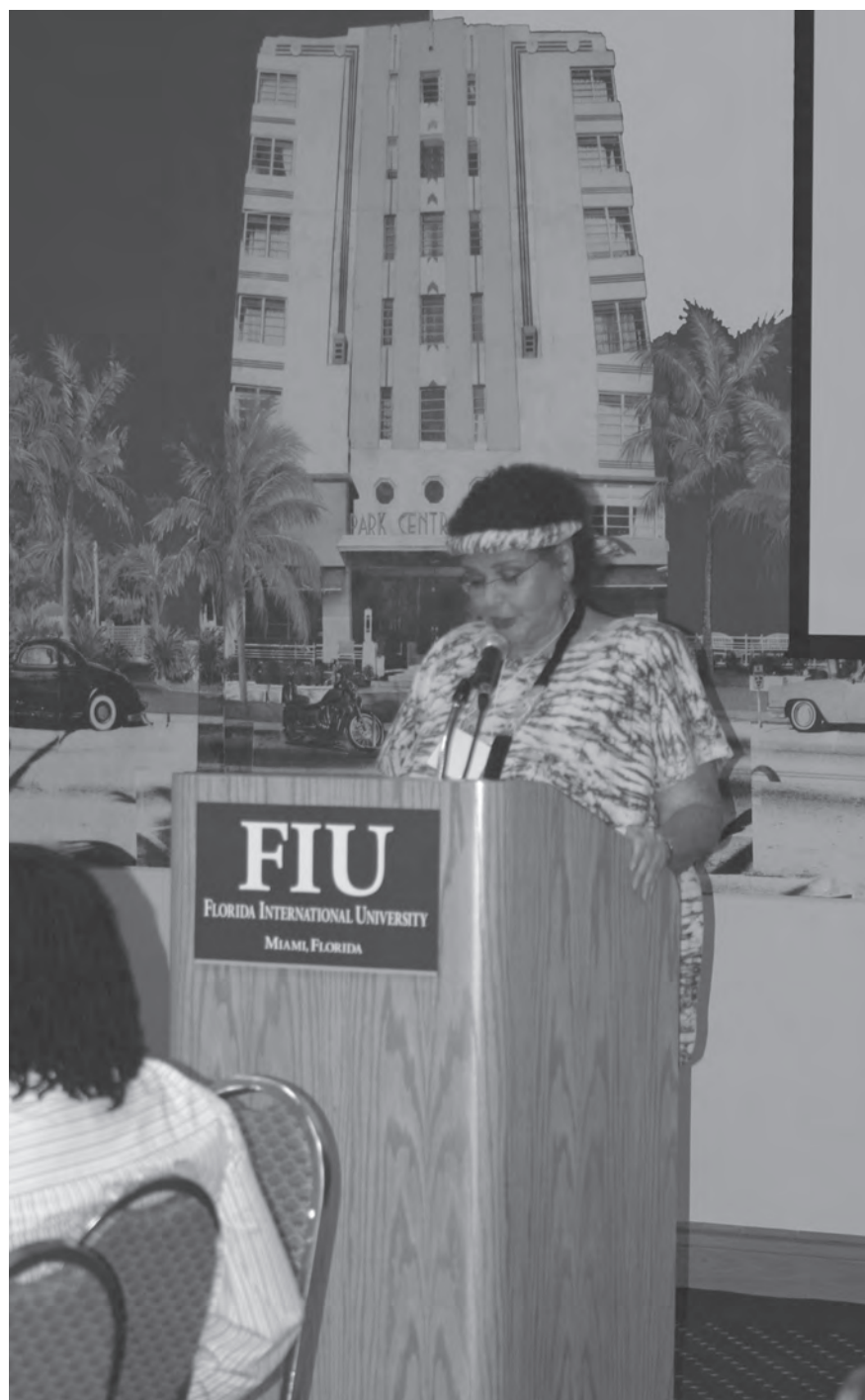
CONFERENCE CALL: Elaine Brown, former chair of the Black Panthers, delivers a speech during an awards ceremony at the first annual Black Student Association conference, Oct. 21 - Oct. 23.

Then stop by GC 210 or WUC 124 to fill out an application for a special position today!