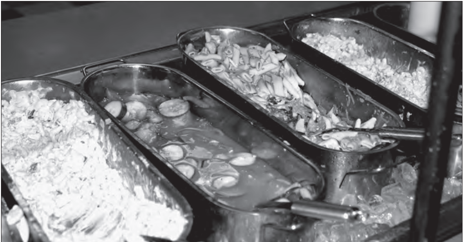
ASSORTMENT OF FLAVORS: The Fresh Food Company cafeteria offers vegetarian alternatives which include the varied selections of the salad and fruit bar.