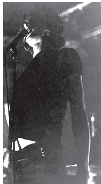
THE FAINT COURTESY PHOTO

The Faint with TV on the Radio and Beep Beep. At the Polish American Club, 1250 NW 22nd Ave. Show starts at 9p.m. $16. All ages. Advance tickets and more information available at epoplife.com .