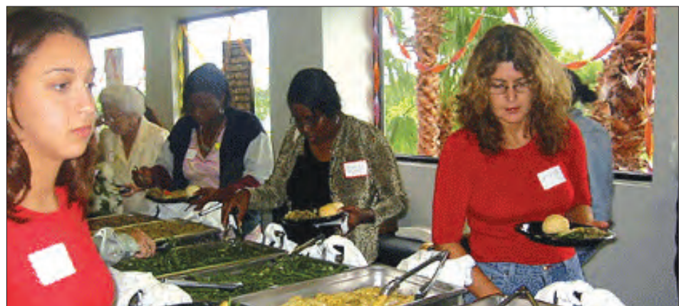
WORLD CUISINE: Students and faculty taste dishes representing different countries and cultures at last year's Diversity Awareness Day.

According to SPC, the event's purpose is to make students aware of the benefits of cultural diversity, to stimulate them to