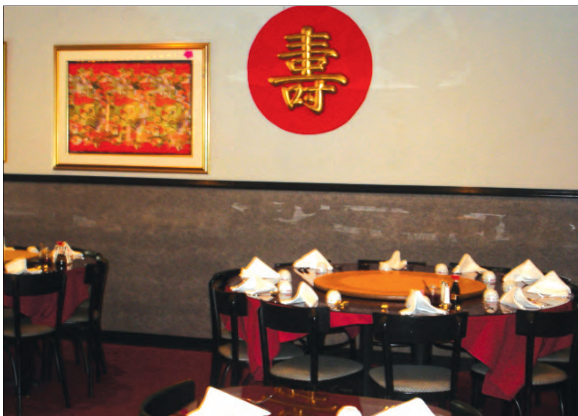
A TASTE OF THE EAST: South Garden serves up authentic chinese cuisine and offers a Dim sum lunch menu in a classy setting.

what you eat, so you never feel compelled to eat your money's worth.