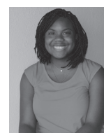
EDITOR IN CHIEF

Programs and Services hopes the outcomes will be. We also speak to professors about how they work to create safe spaces in their classrooms.