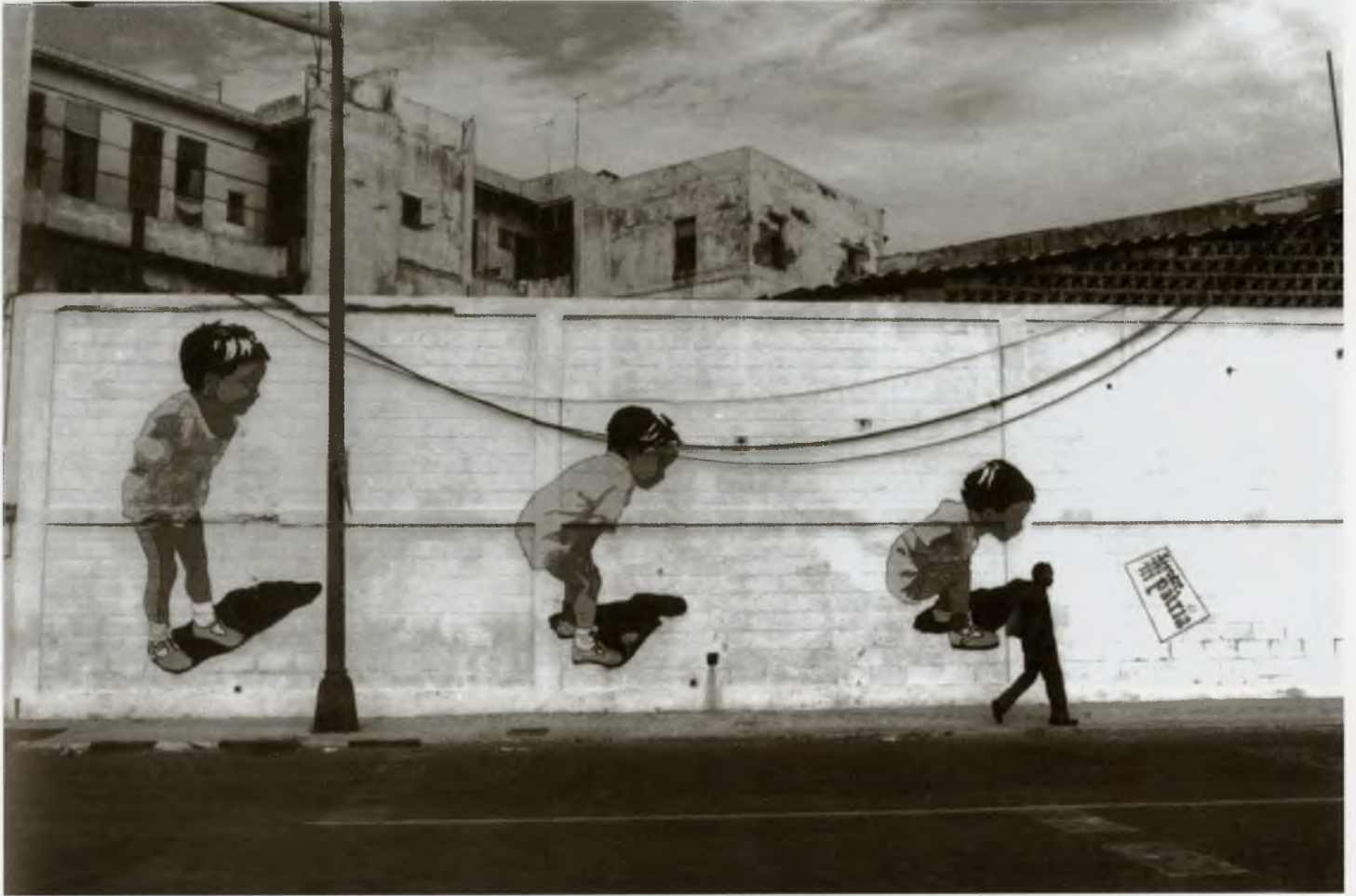
The Vigilant Mural (El mural vigilante), Havana, 1993