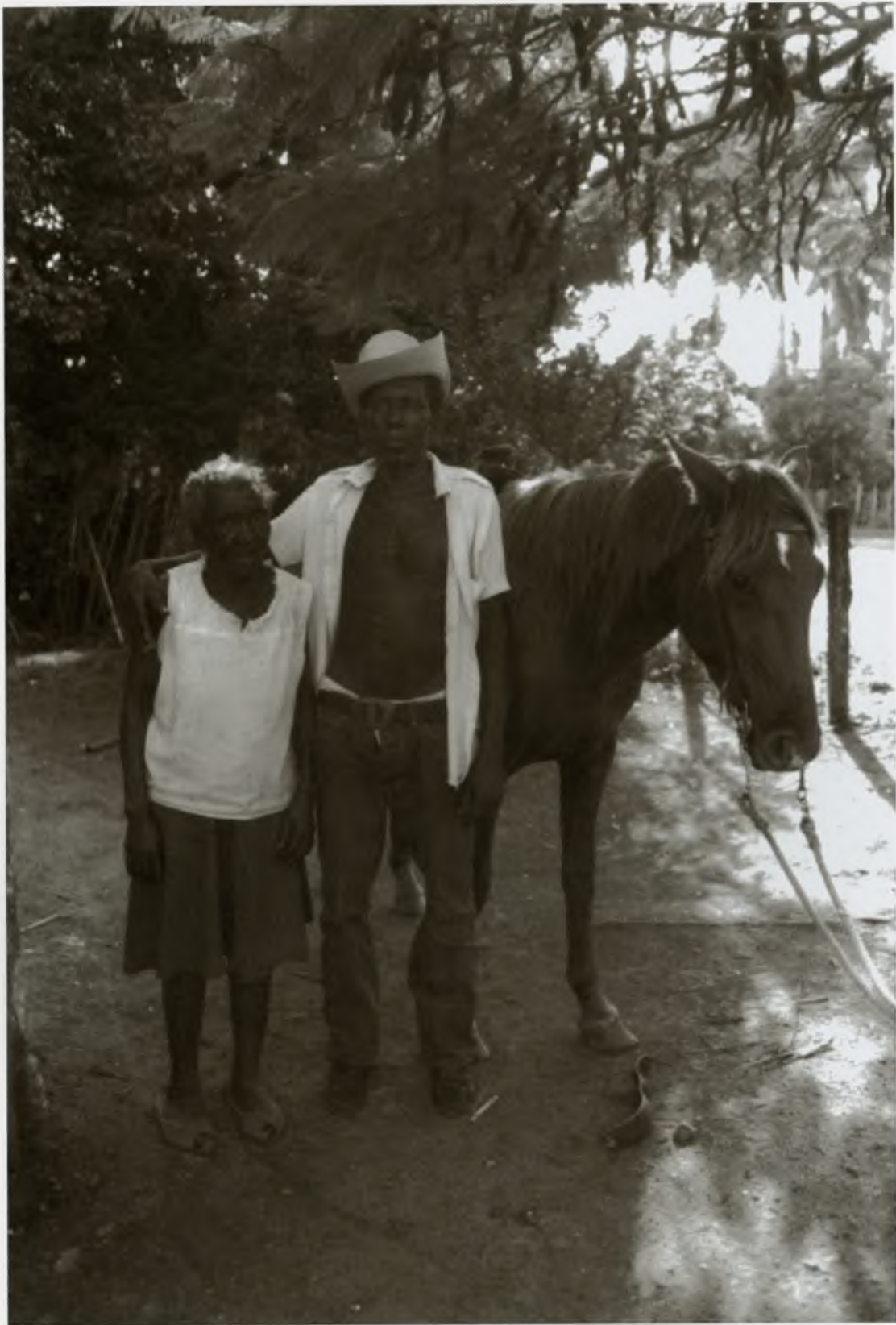
Countryside Family Portrait #11 (Retrato de familia guajira #11), Camaguey, 1994