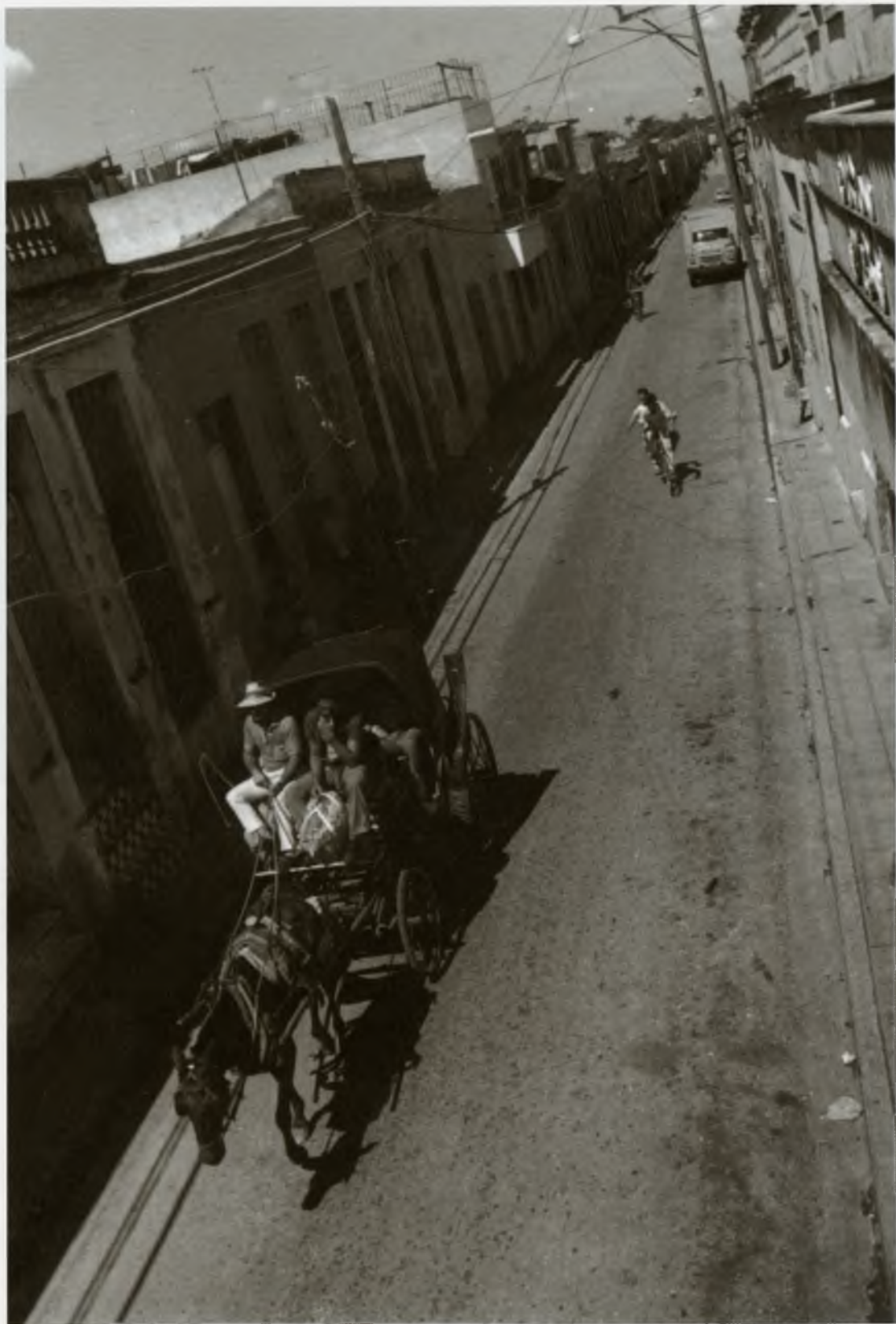
The Long Road Down (El largo viaje hacia abajo), Camaguey, 1993