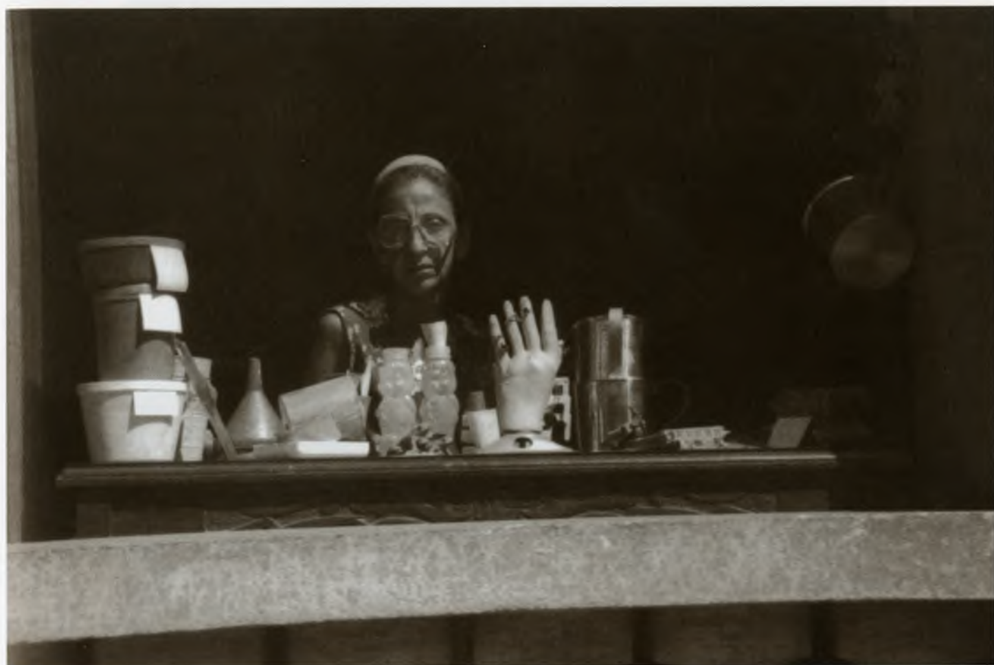
Everything For Sale (Todo se vende), Havana, 1994