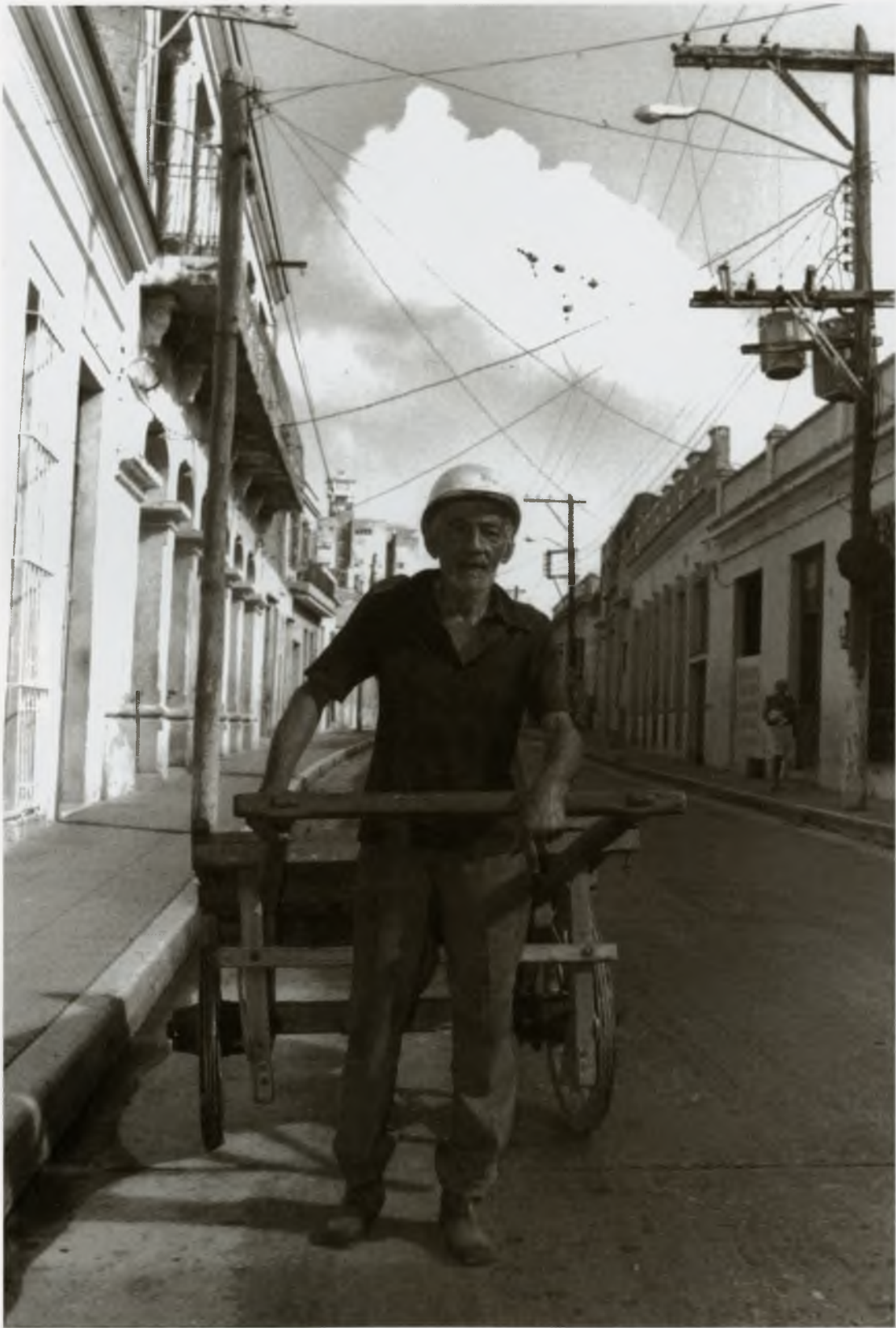
The Heroic Work (El trabajo heroico), Camaguey, 1993