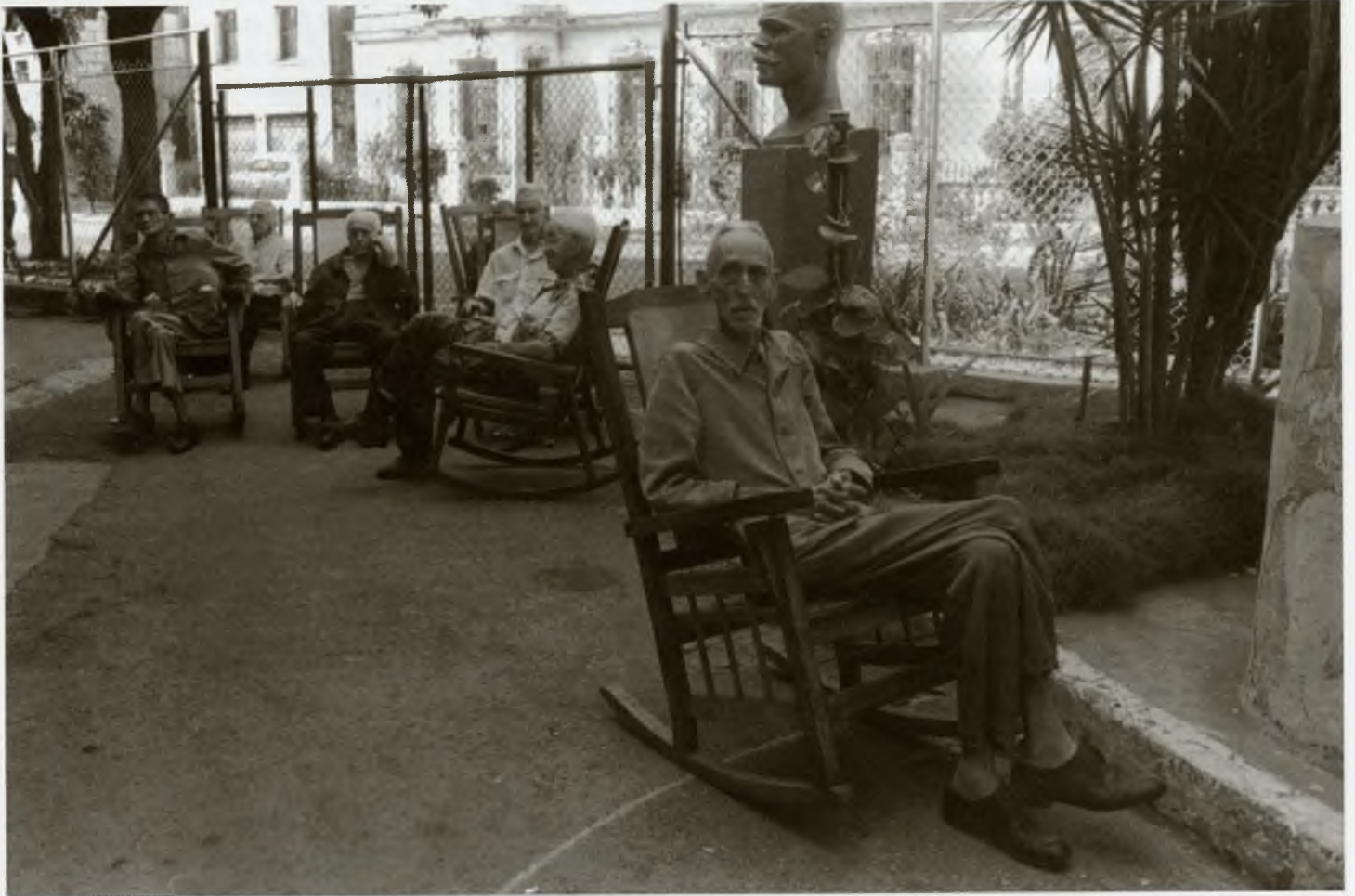
Nursing Home (Asilo de Ancianos), Havana, 1994