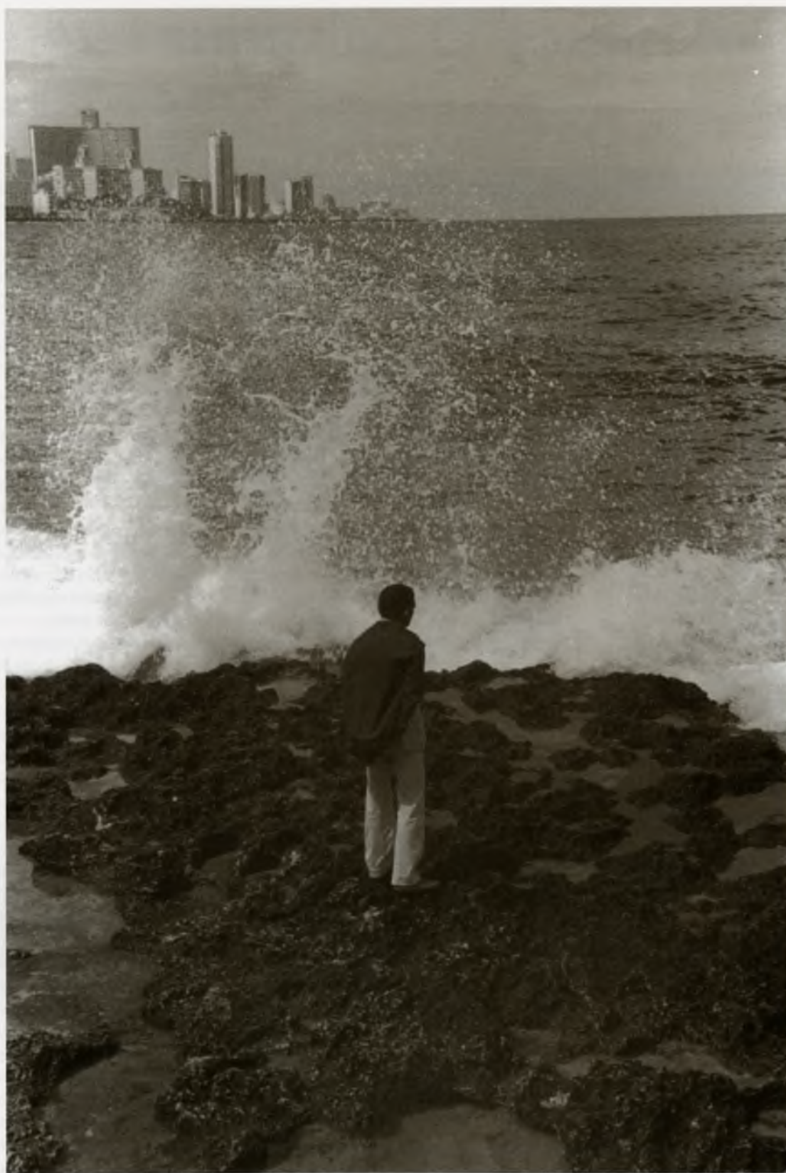
Yearning for the Sea (Añorando el mar), Havana, 1994