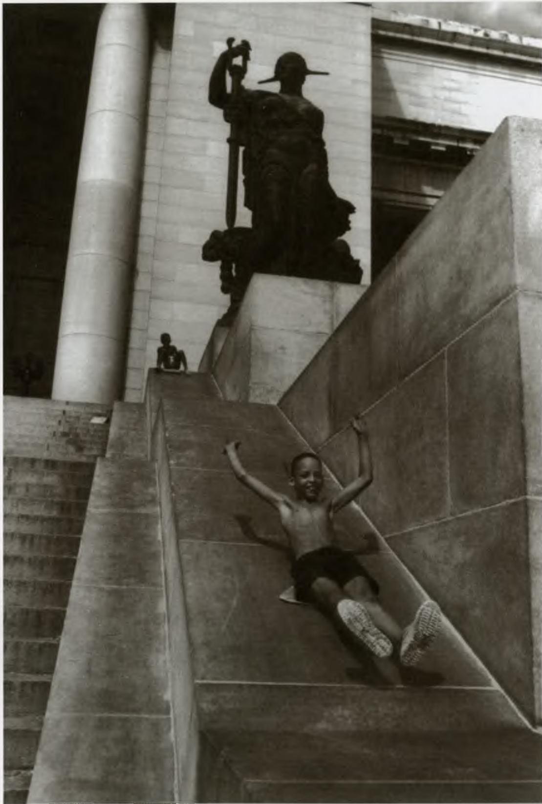
Capitolio Games (Juegos en el Capitolio), Havana, 1993