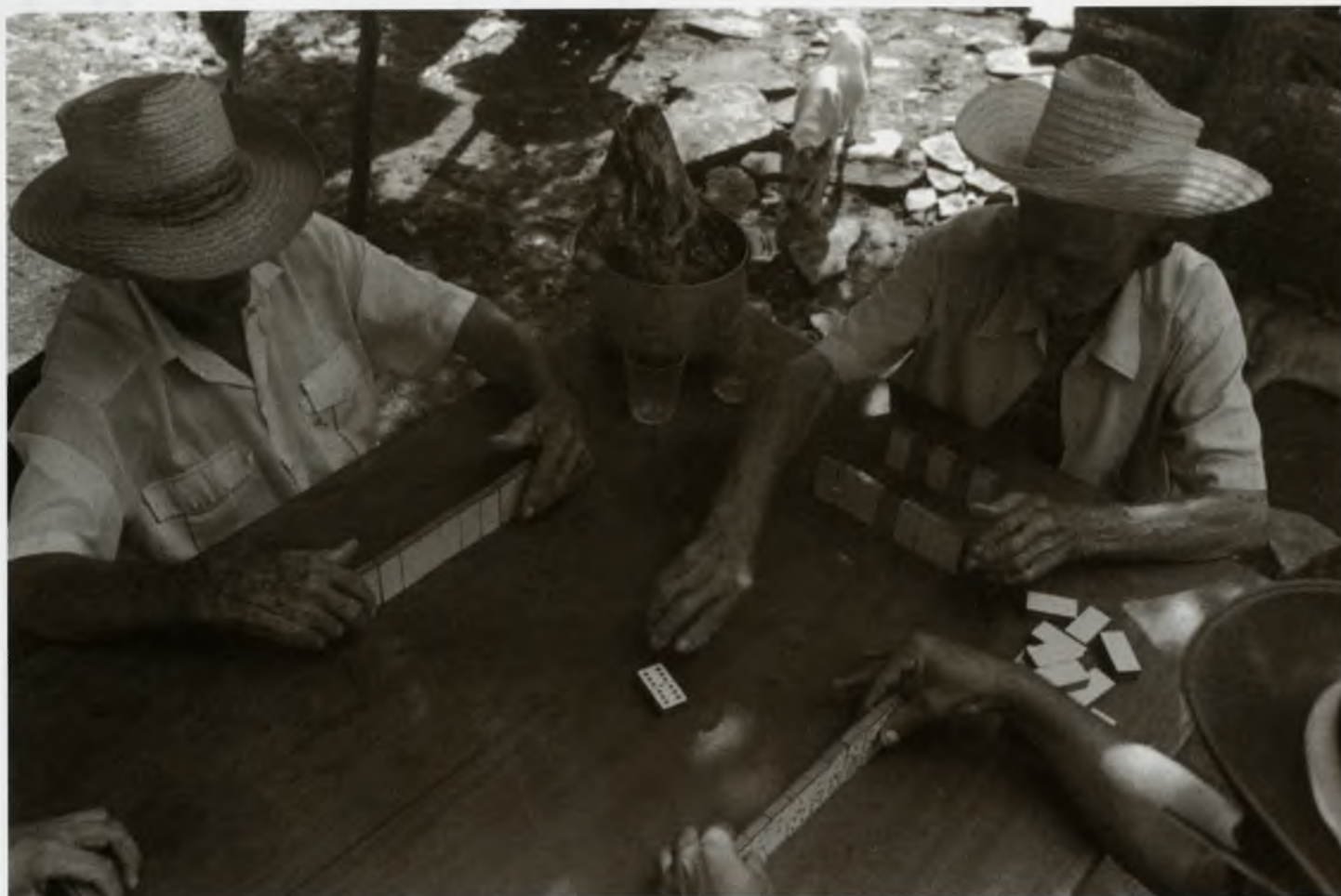
The Trophy (El trofeo), Camaguey, 1994