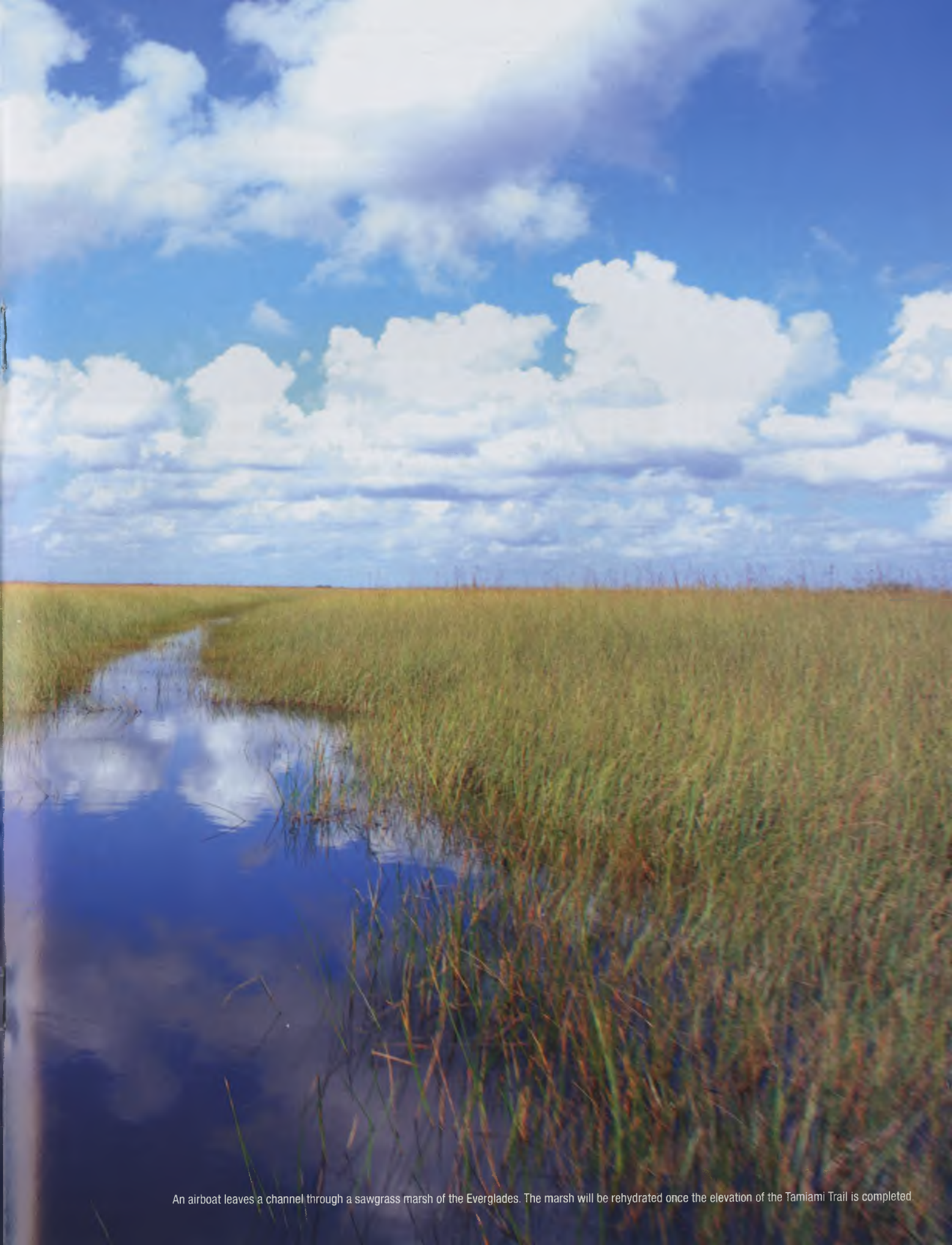
An airboat leaves a channel through a sawgrass marsh of the Everglades. The marsh will be rehydrated once the elevation of the Tamiami Trail is completed