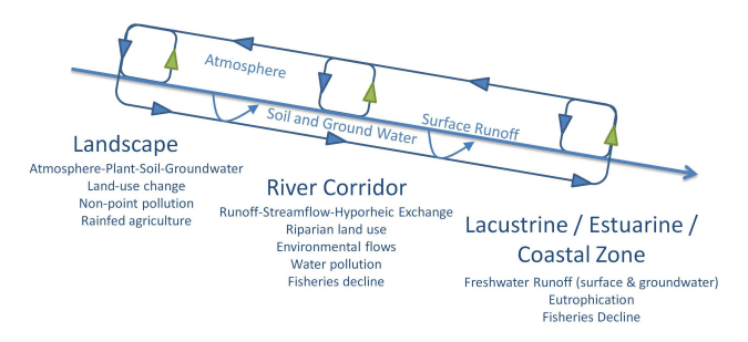
Fig. 1. Schematic representation of spheres of ecohydrology and key processes and issues highlighted in this paper. Spheres are integrated in the continuum of the hydrological cycle and considered in the context of hydrographic catchments extending from headwater landscapes to estuaries and coastal seas.

process-level changes brought by land use change, ecohydrologists are also working to develop and improve modeling tools to assess impacts over entire catchments (Fohrer et al., 2005; van Griensven et al., 2006). Ecohydrologists are certainly concerned with the conservation of natural landscapes, but the applied area in which they are likely to play the largest role is in improved food production in rainfed agriculture (Falkenmark and Rockström, 2004, 2006; Rockström et al., 2009).