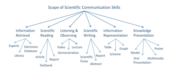
Fig. 3. Components of effective scientific communication. Redrawn from Spektor-Levy et al. (2009).

the days of the Garvey-Griffin Model, which described the traditional paper-based system of publications followed by indexing of abstracts and retrieval of bound journals from the library shelf for photocopying (Garvey and Griffin, 1972). The near paperless communication system of today is far more dynamic and interactive (Hurd, 2000), and the future impacts of a growing number of social media tools are only beginning to be studied (Arslan et al., 2011; Sublet et al., 2011). Because ecohydrologists deal with applied issues that often capture the interest of the general public, instruction should also be offered in speaking to general audiences and even writing in more popular styles. Training in these topics may be less formal and offered in seminars, workshops, or online tutorials in association with degree programs.