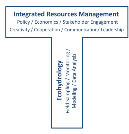
Fig. 2. T-shaped competencies of an ecohydrologist. The vertical bar reflects the depth of specialized scientific knowledge, while the horizontal bar reflects cross-cutting knowledge of related disciplines as well as personal competencies enabling more effective participation in collaborative teams.

sum of associated skills and world view that constitute the scientific ethos (Merton, 1976).