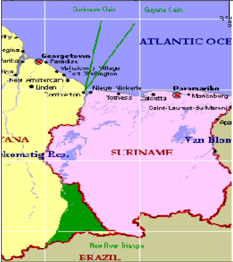
Figure 1 – Guyana-Suriname Disputed Areas

the territorial saga. 19 Perhaps the most significant—and daring—development was Suriname’s presenting to the world what it had long done within Suriname: cartographically portraying the area as part of its territory.