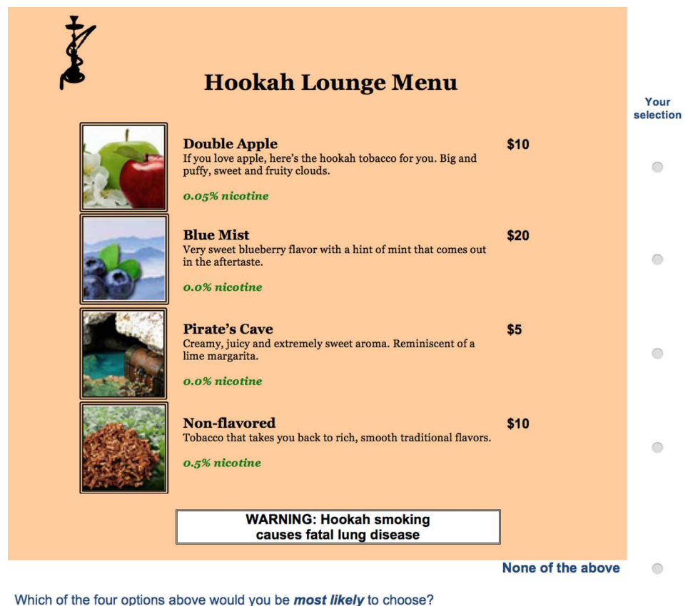
Figure 1 Discrete choice experiment: Sample choice set*. *Attributes and levels: Flavour (Double Apple, Blue Mist, Pirate’s Cave, Non-flavoured); Nicotine content (0.0%, 0.05%, 0.5%); Price ($5, $10, $20).