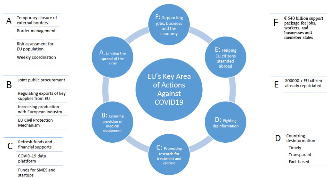
Figure 2. The EU's emergency response to the COVID-19 pandemic.