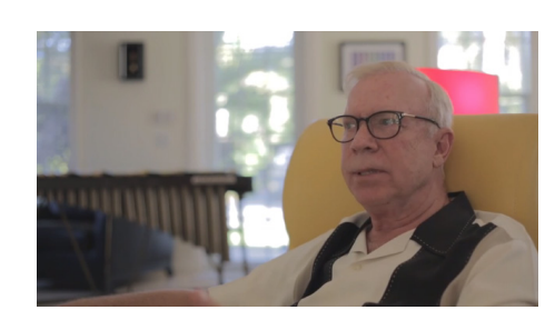
CREATIVITY & FLEXIBILITY 3:18 min.

How does music criticism differ from other forms of criticism?