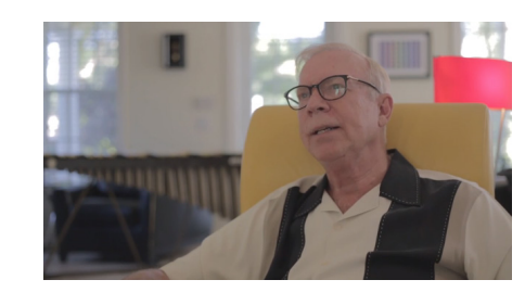
SEIZE THE MOMENT - 5:20 min.

Where did you grow up? What was your first exposure to music? How did you become passionate about jazz?