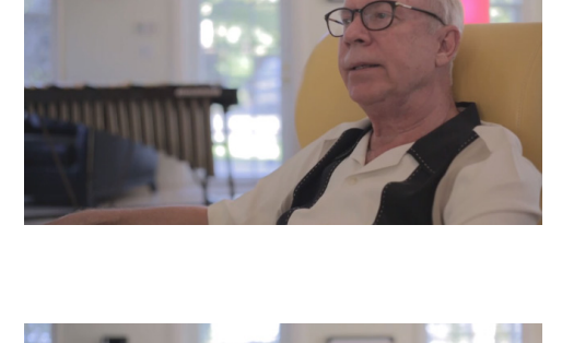
How did your green new manager become an astute evaluator of talent?