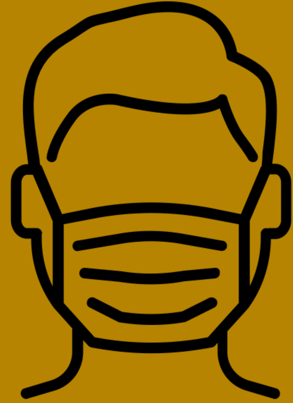
Created by ArashDesign from Noun Project

Three separate swabs/cuttings were collected from each individual mask. The first swab was analyzed using conventional DNA methods. The second swab was cut and analyzed conventionally. The third swab was processed on the Applied Biosystems™ RapidHIT™ ID System, removed, then analyzed conventionally.