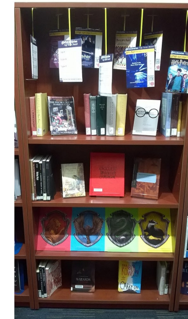
Harry Potter Display