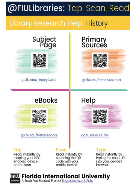
Subject Librarian Posters